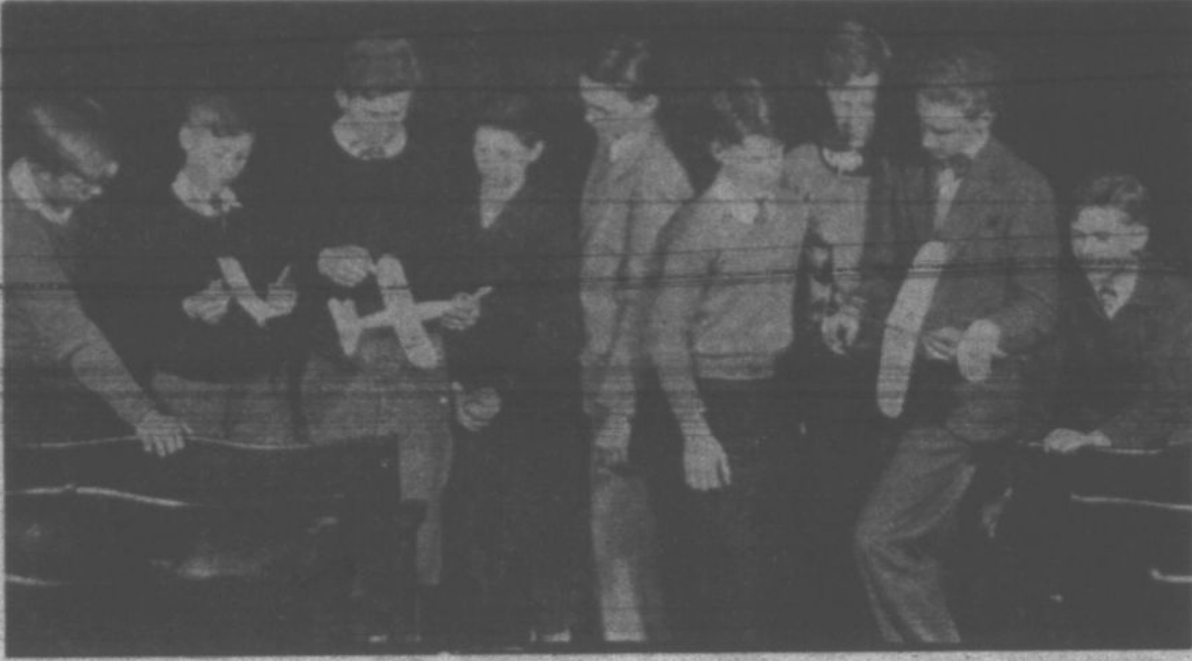
A group of members of the Airplane club inspecting models that may be seen soaring about the auditorium during nearly any lunch period and after school at Deerfield-Shields high school.