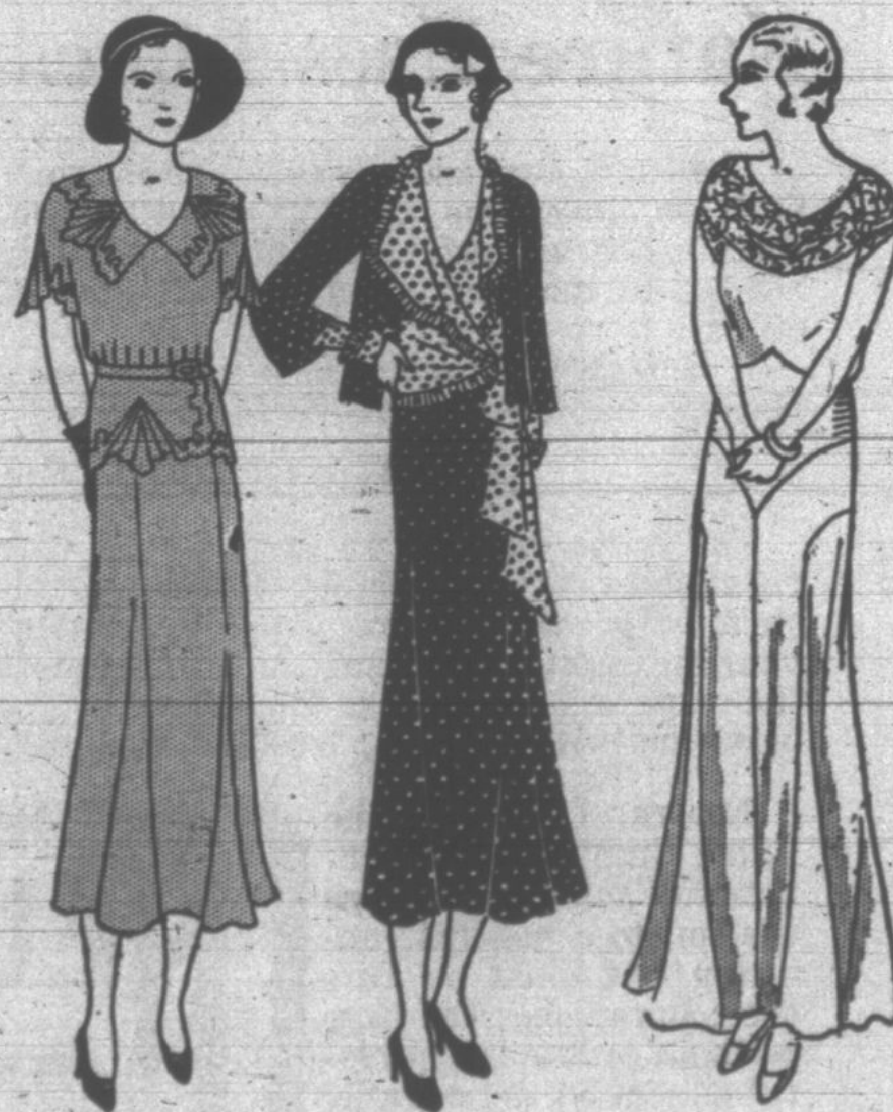
Left — Beige chiffon and lace fashion a dinner frock at $16.50.