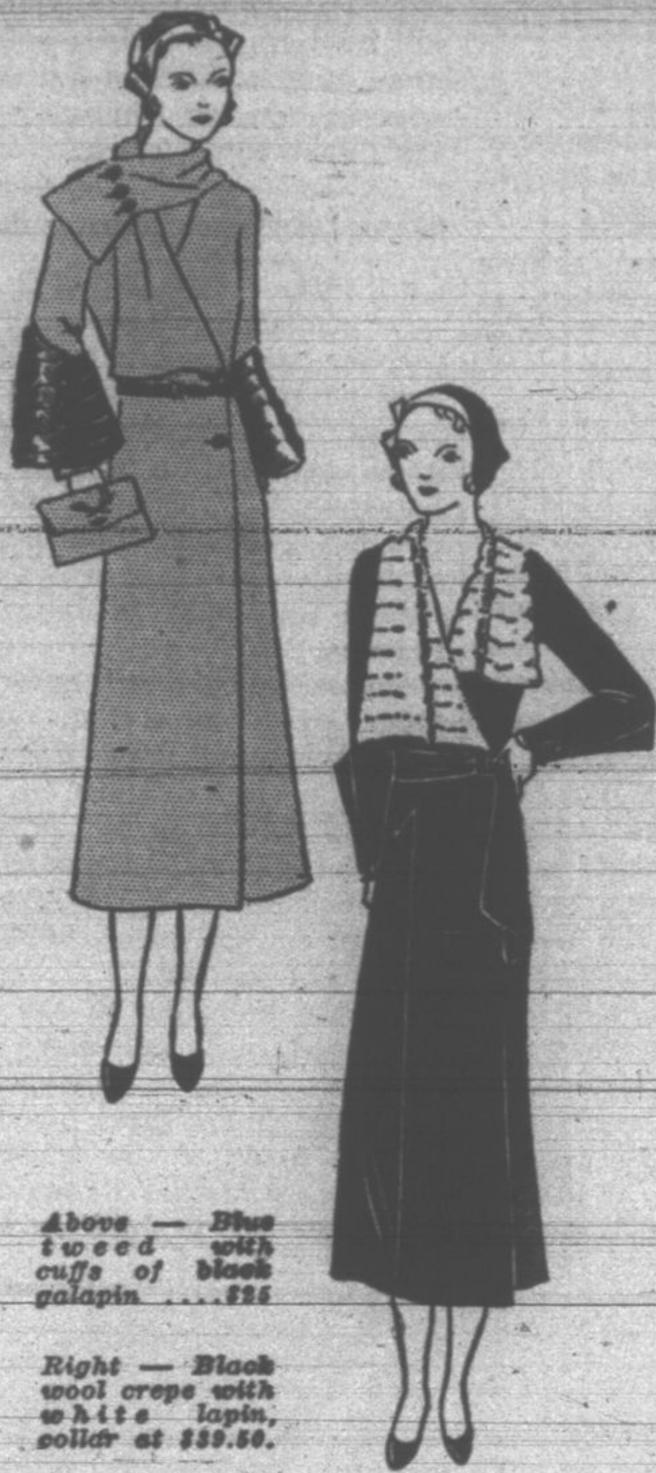
Above — Blue tweed with cuffs of black galapin . . . $26

Perhaps it's a jaunty tweed, with an Ascot scarf . . . a slim tailored model in skipper blue . . . or any one of a varied and ultra-smart selection priced from $15 to $49.50.