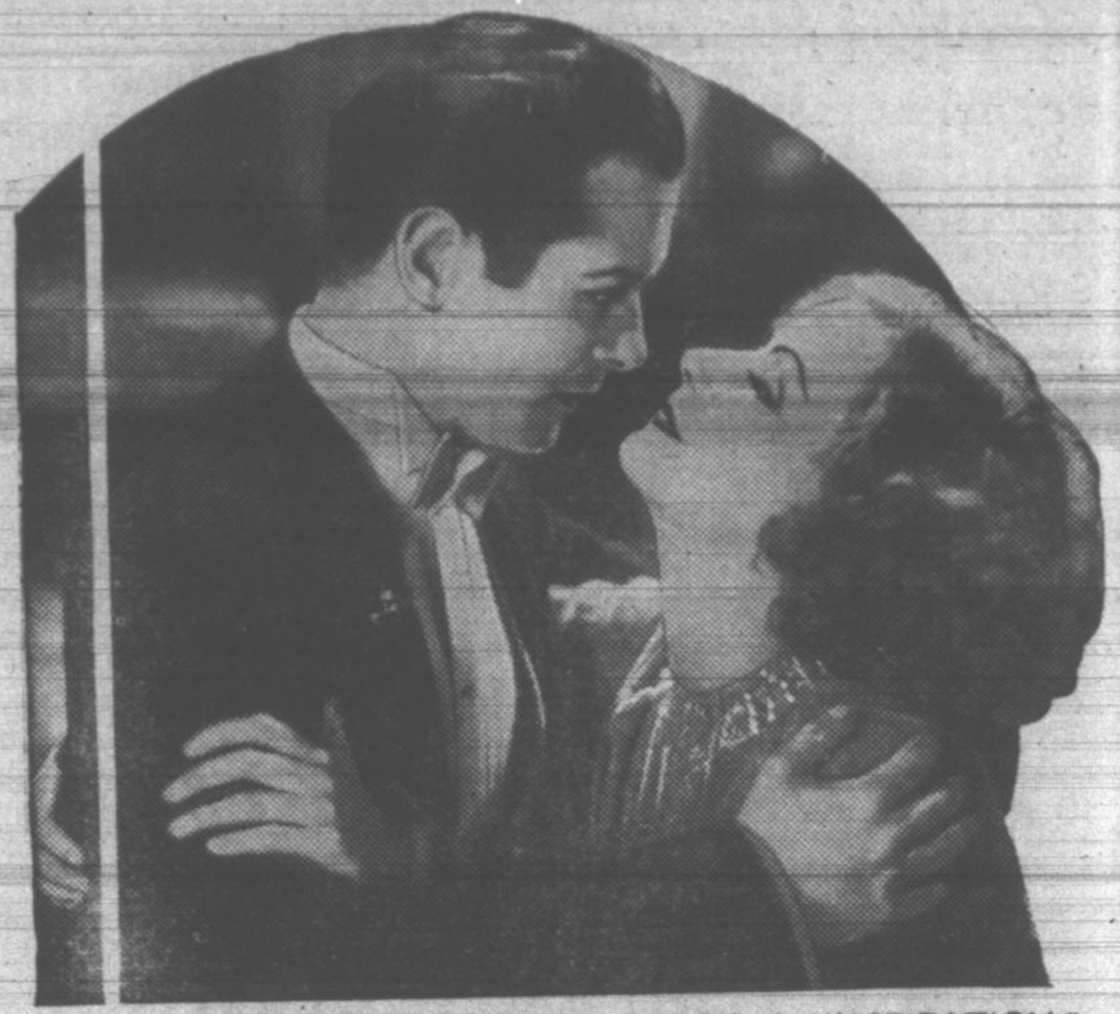
ROBERT MONTGOMERY and GRETA GARBO in "INSPIRATION" To be shown at the Alcyon Theatre, Tuesday and Wednesday