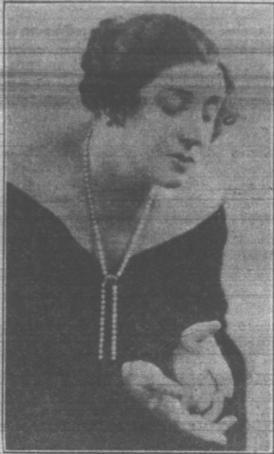
Mrs. Patrick Campbell