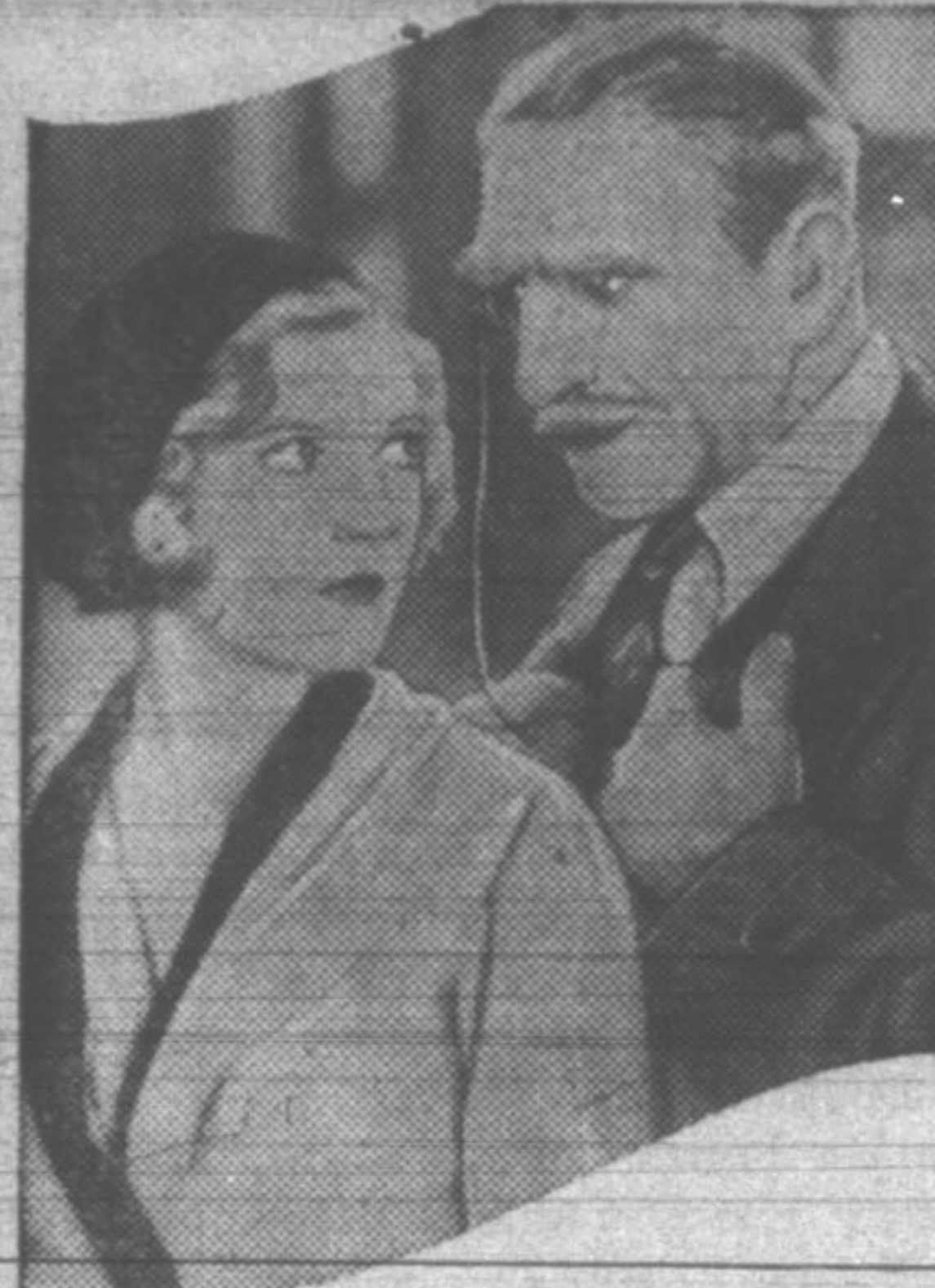
MARION DAVIES and C. AUBREY SMITH in "THE BACHELOR FATHER"