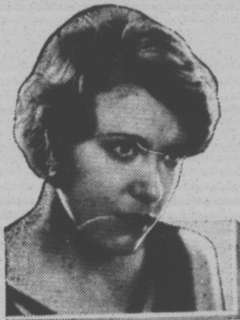
RUTH CHATTERTON in "The Right to Love" A Paramount Picture