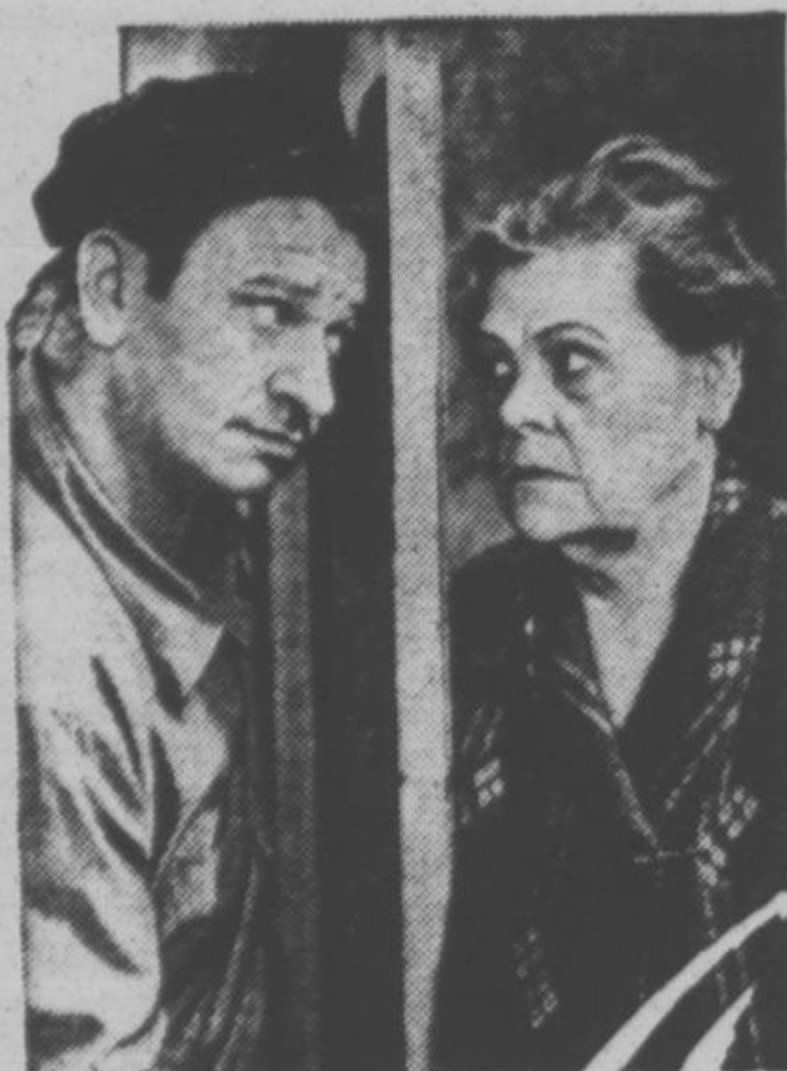
WALLACE BEERY and MARIE DRESSLER in "MIN AND BILL"

Wallace Beery, a convict in his great hit, "The Big House," becomes a good-natured fishing barge captain in his newest role in "Min and Bill," Metro-Goldwyn-Mayer's vivid waterfront drama. Marie Dressler plays the other principal role, and Dorothy Jordan, Marjorie Rambeau and others of note are in the cast.