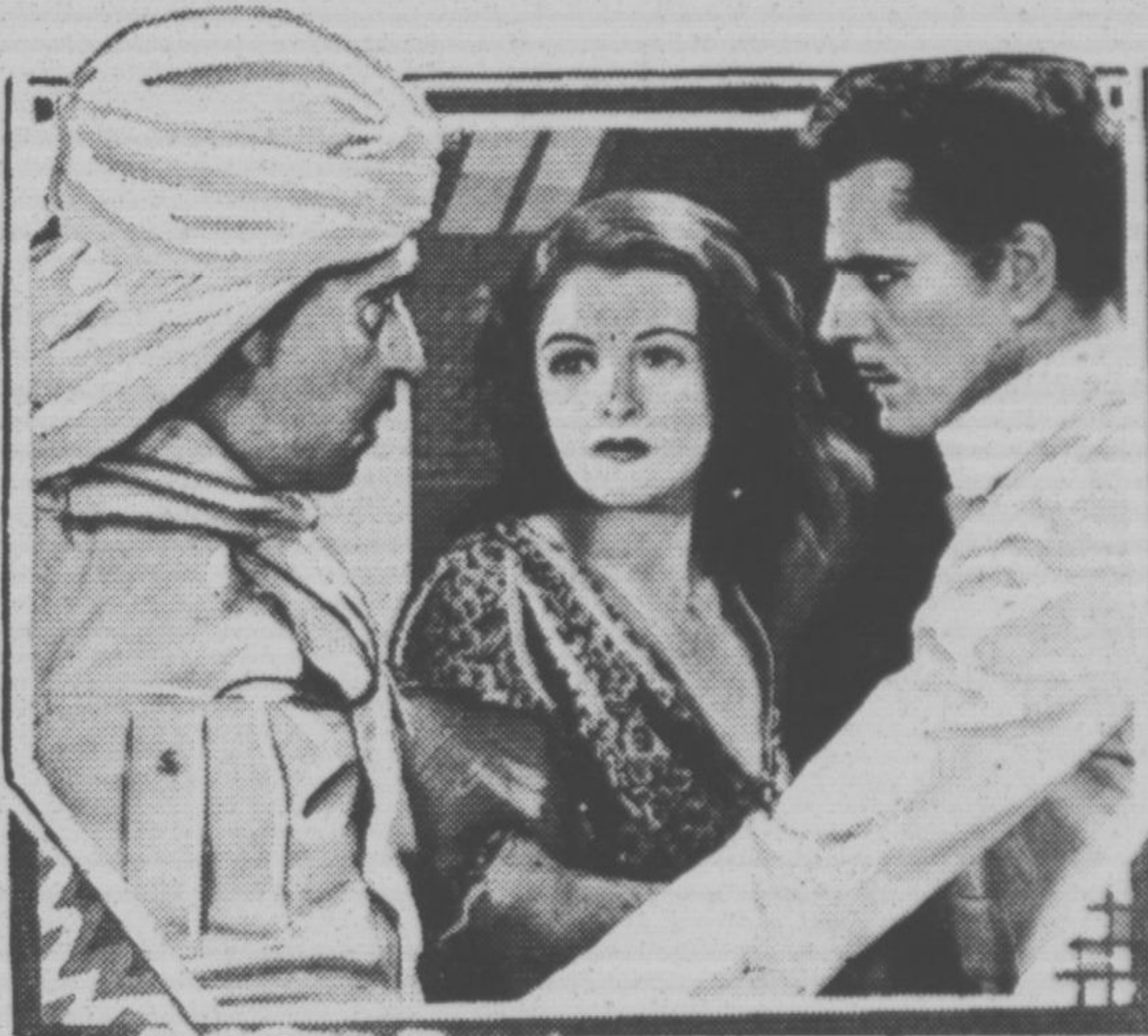
Noah Beery, Myrna Loy and Warner Baxter in a scene from "Renegades," Fox Movietone picture. Showing at the Deerpath Theatre, Lake Forest, Sunday and Monday, Jan. 4 and 5