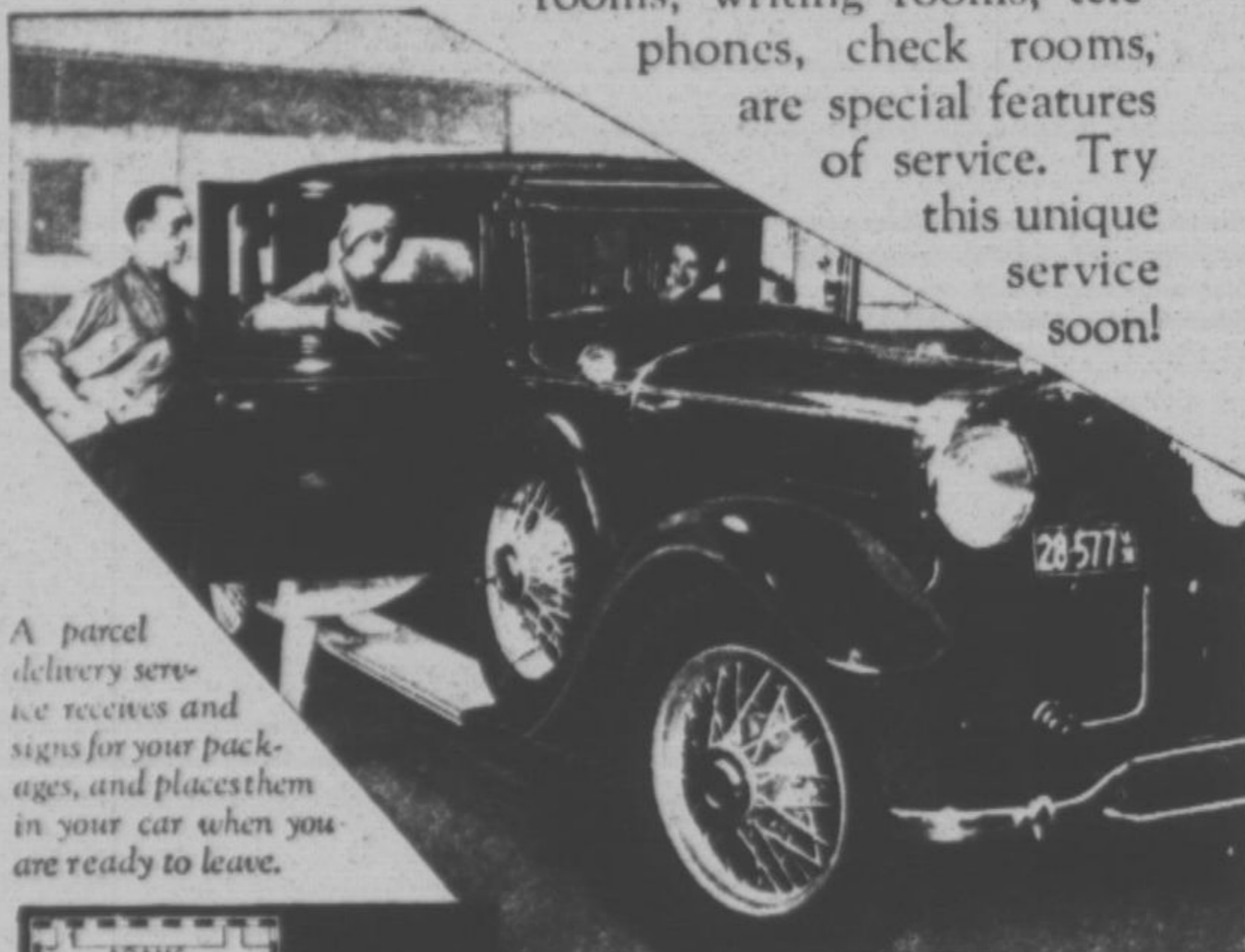
A parcel delivery service receives and signs for your packages, and places them in your car when you are ready to leave.

The atmosphere of a fine hotel, plus rest rooms, writing rooms, tele-phones, check rooms, are special features of service. Try this unique service soon!