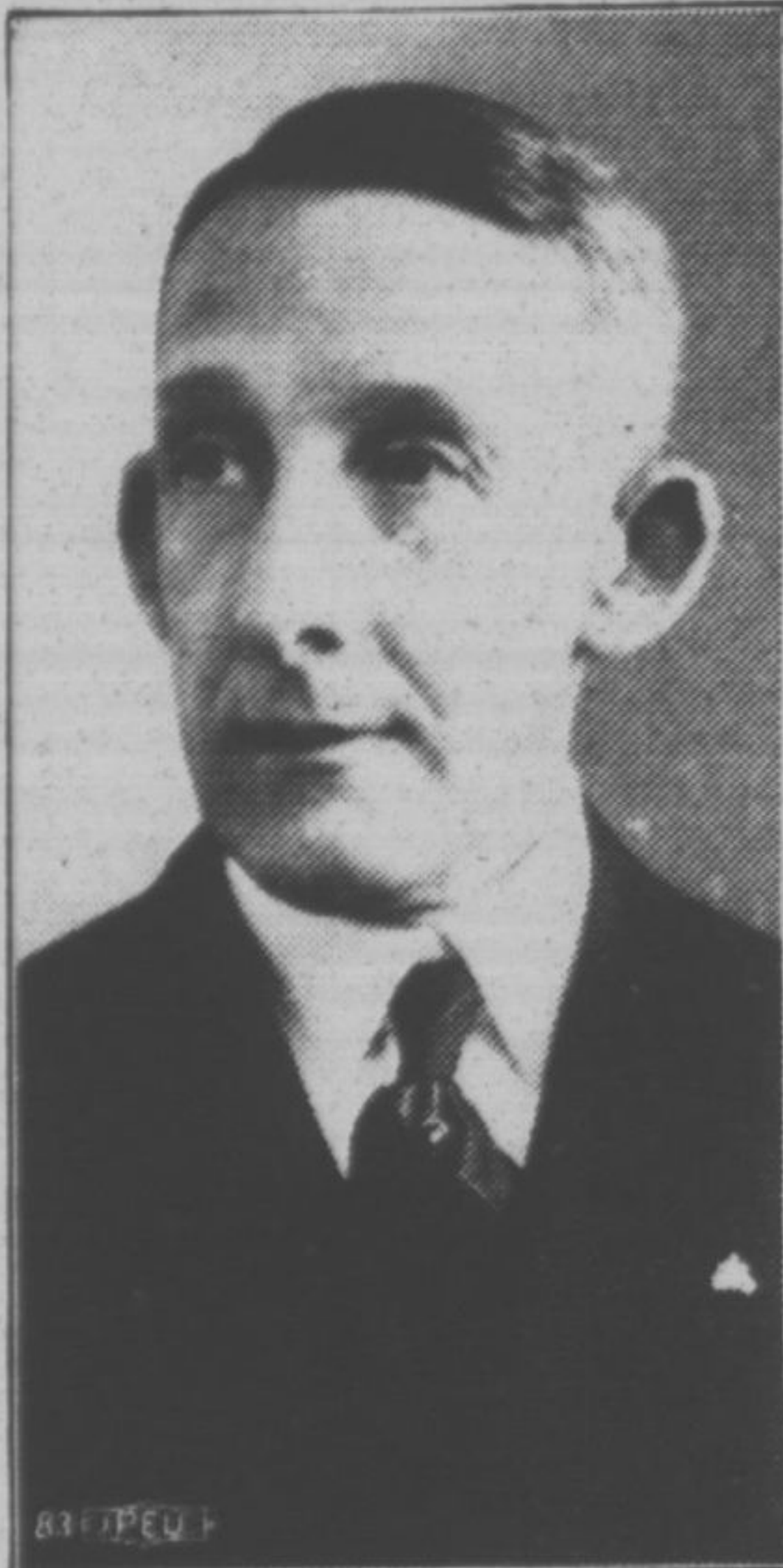
GOVERNOR LOUIS L. EMMERSON