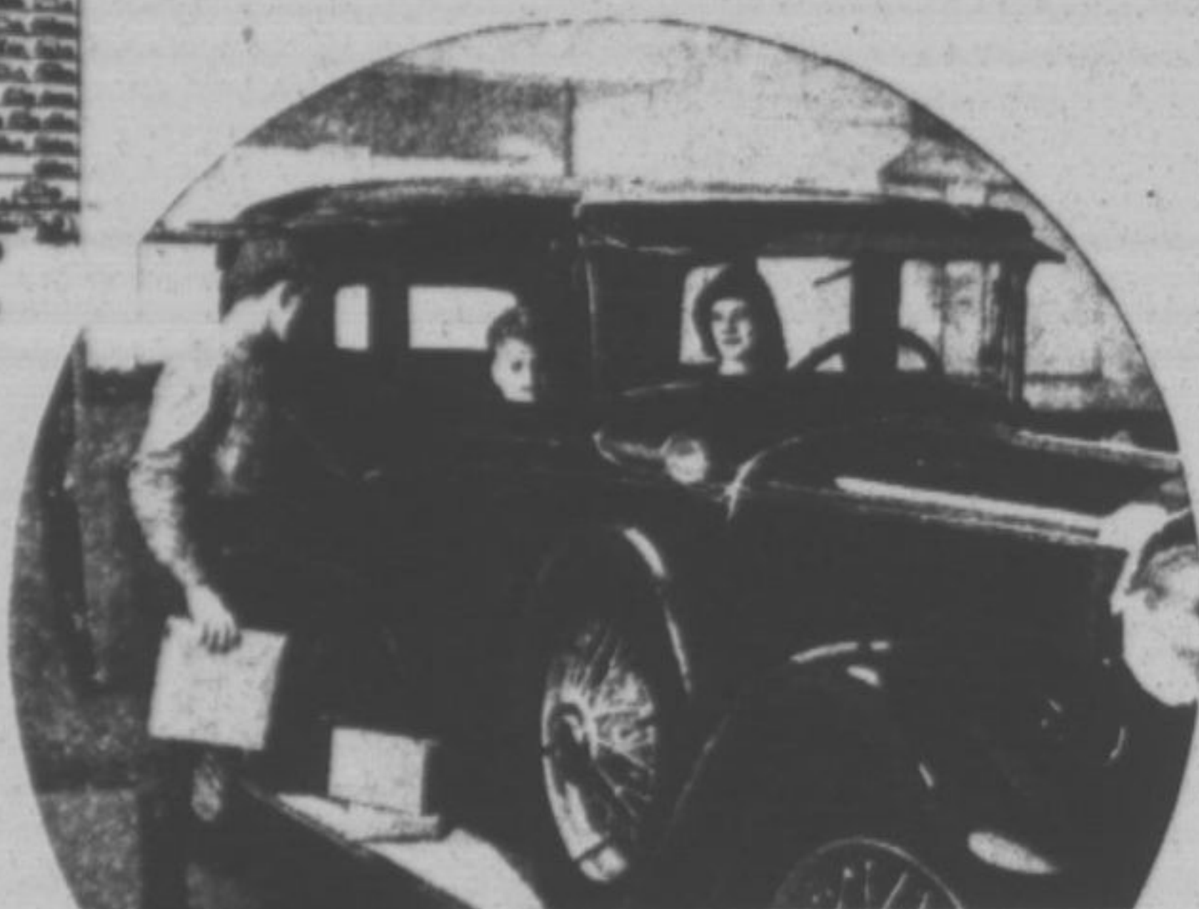
At each garage a special parcel service receives your packages, signs for them, and places them in your car when you leave.