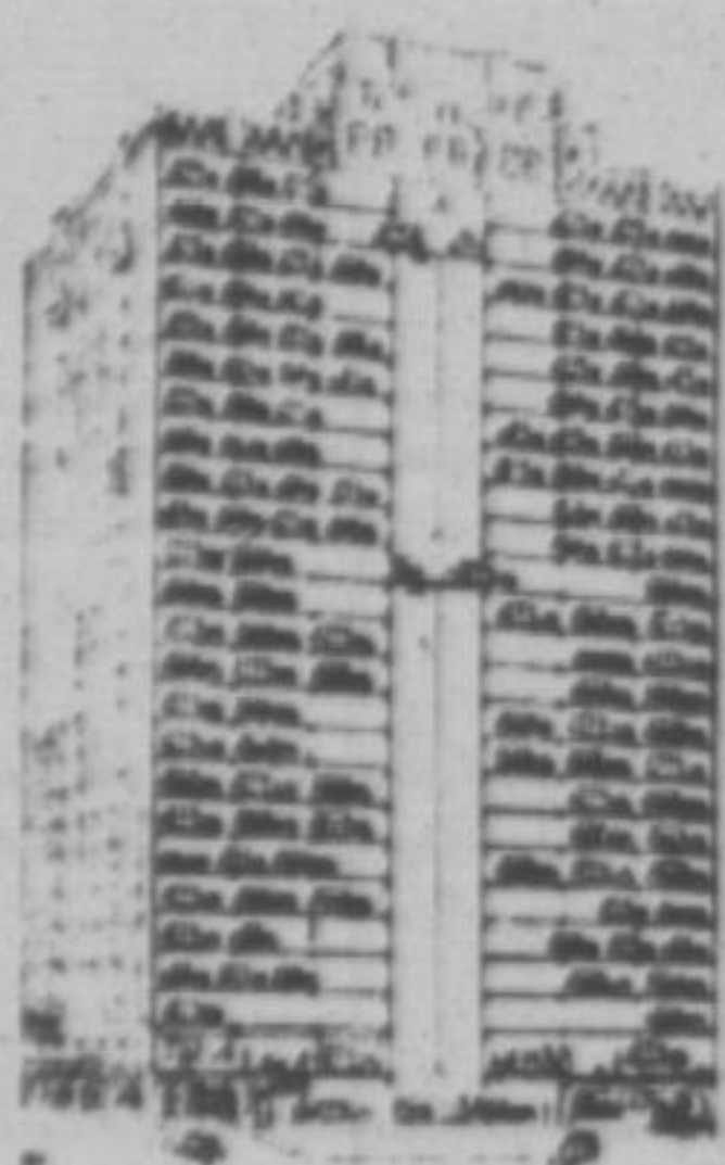
The Quincy Parking Garage. A new $1,000,000 building, as spotless and attractive as a fine hotel.

An atmosphere like that of a fine hotel, with rest rooms, writing rooms, telephones and check rooms, are additional features.