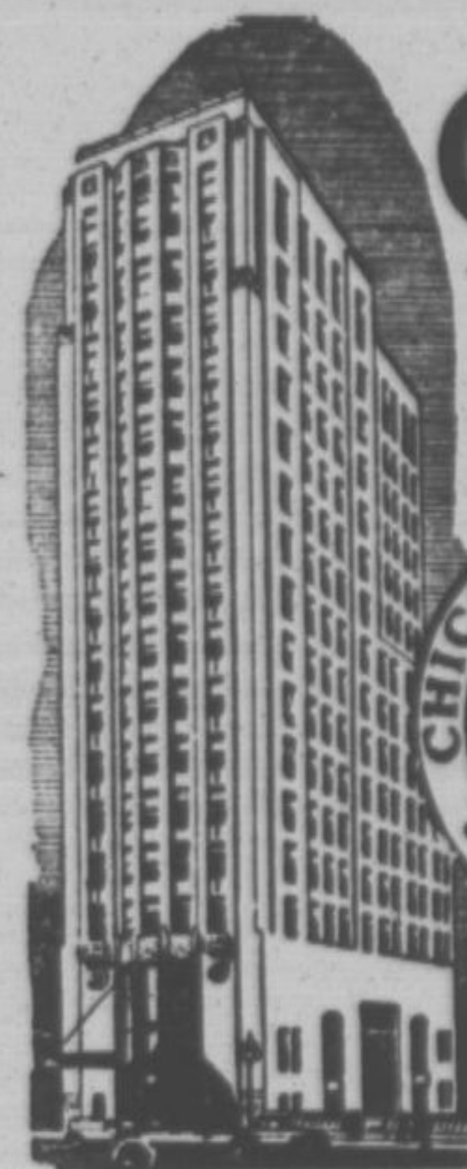
The Chicago Motor Club Building at 66 East South Water Street

Sixty-four branches: 34 down-state; 30 in Cook County. Dues per year $10.00. Enrollment fee (first year only) $5.00 Write for free booklet. Clip coupon below.