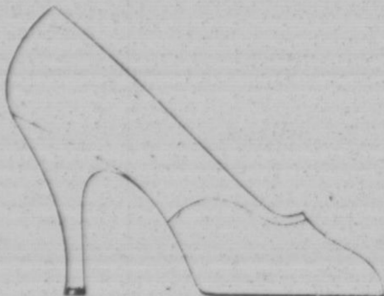
A smart Opera Pump in a variety of leathers