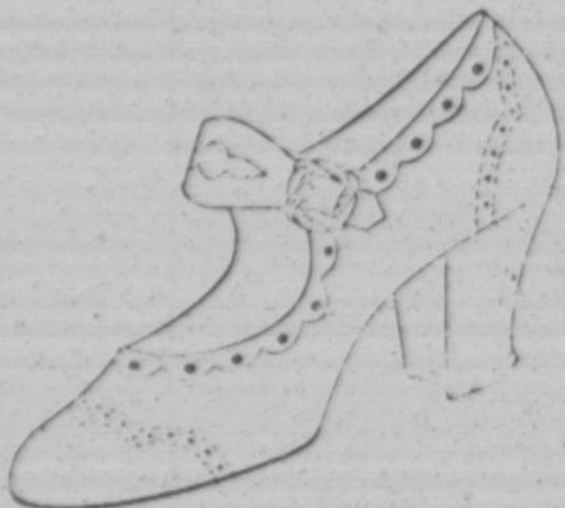
Brown Lizard side buckle Strap Pump for street or sportwear