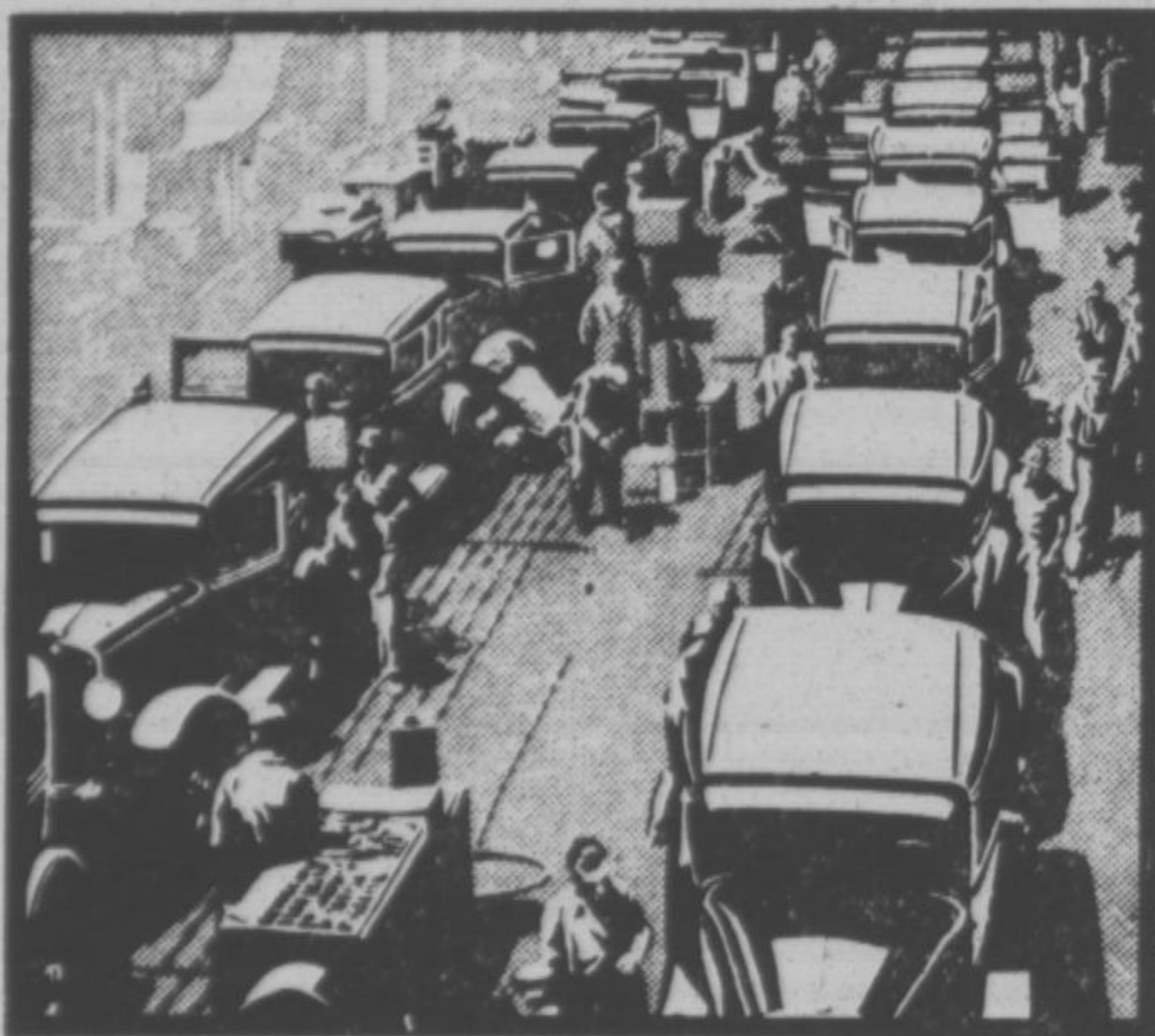
Modern production methods assure high quality

any model can be bought for a small down payment and easy monthly terms! Come in today. Learn for yourself why two million buyers have agreed—"it's wise to choose a Six."