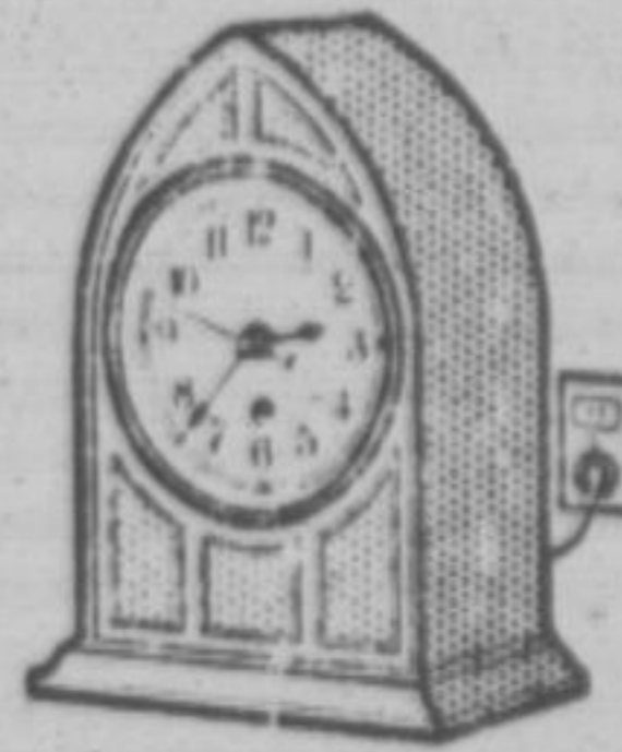
The Ravenwood—A small all round model at a very low price. Cash $9.75. With alarm, $12.50.

Any old clock, whether it runs or not, will be worth one dollar toward the purchase of any Hammond Model priced at $14.50 or less and two dollars toward any priced at more than $14.50. This offer ends on August 30. Take advantage of it now.