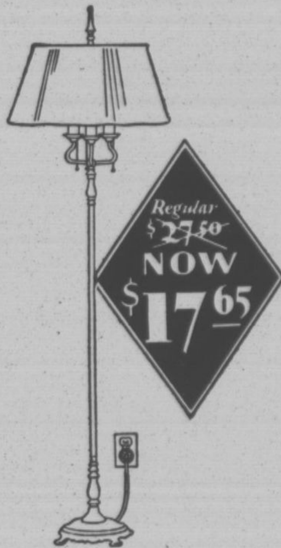
Three-candle floor lamp with plated bronze base and silk shade. Only $17.65.

The same bargain prices that opened our annual sale of lamps last month have been continued into June. Interesting displays of both floor and table models to make selections from. All are of recent design and all are marked unusually low.