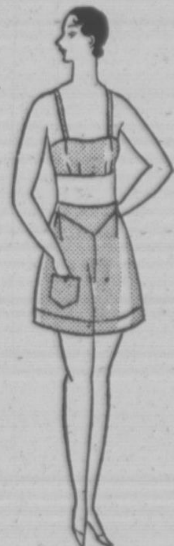
The Rayon Flat Crepe Dance Set $1

Other Dance Sets of Figured Broadcloth are priced at $1 set.