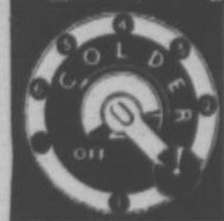
The "Cold Control"

—offered only by Frigidaire— keeps vegetables crisp and fresh