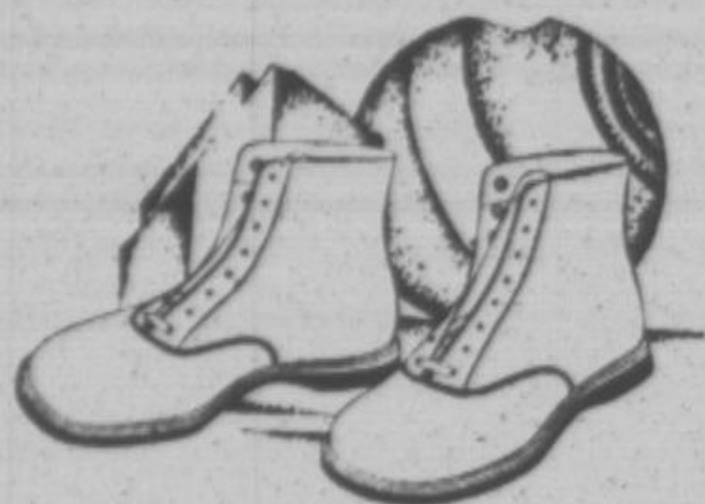
CHILD'S SHOE Elk, Tan, White Calf, White Buckskin. 5 to 13 1/2

Specialists in PERMANENT WAVING - MARCELLING - FINGER WAVING Room 209 Waukegan National Bank Bldg. PHONE MAJESTIC 3622 WAUKEGAN, ILLINOIS