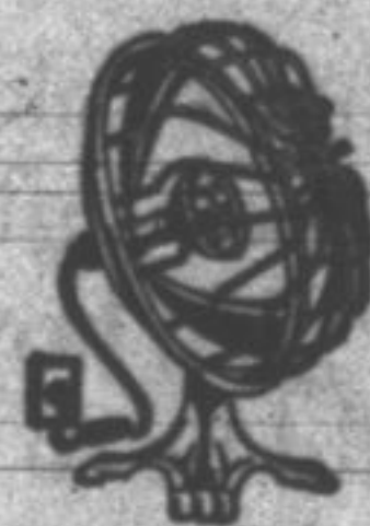
Hotpoint Focalipse Heater, Chromium plated 12-inch reflector $9.50*

—with one of these specially-designed Focalipse Heaters. Fine for baby's bath, taking the chill from the bedroom on cold mornings, and wherever extra heat is wanted.