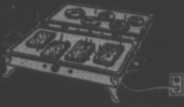
Table Stove and Sandwich Cooker $18