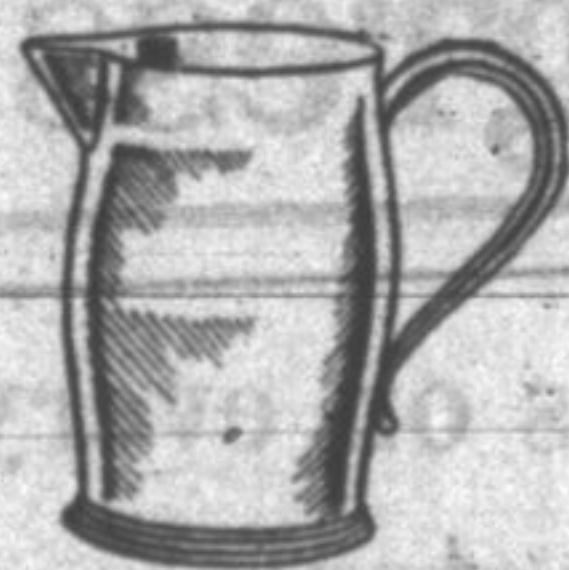
Pewter Water Pitcher. Attractive shape. Originally modelled by Paul Revere. Priced $5