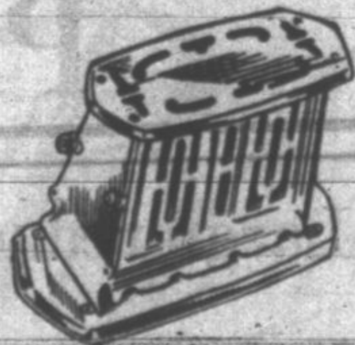
Electric Toaster, Nickel Plated ... Toasts evenly. Complete with cord and plug at $2.95