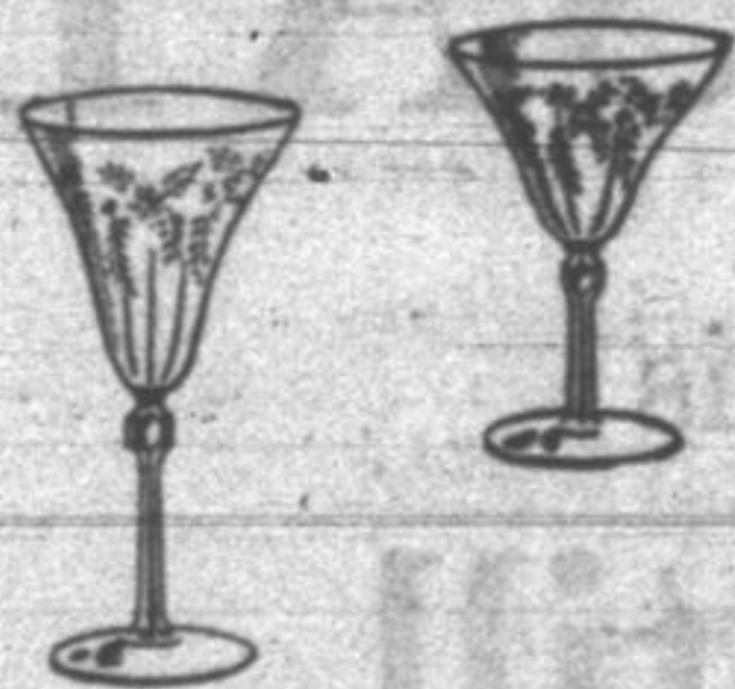
Crystal Stemware light cut formal shapes with long stems. Exceptional at $1