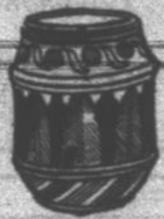
Italian Majolica Vases. Various sizes and shapes. In rich colors. Special $3.50