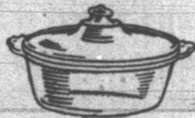
Pyrex Casserole with cover. 1-quart size. Cooks well. Specially priced at $1