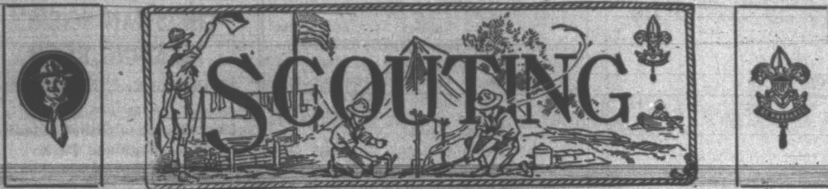
A regular feature prepared each week by members of the Boy Scout Press Club