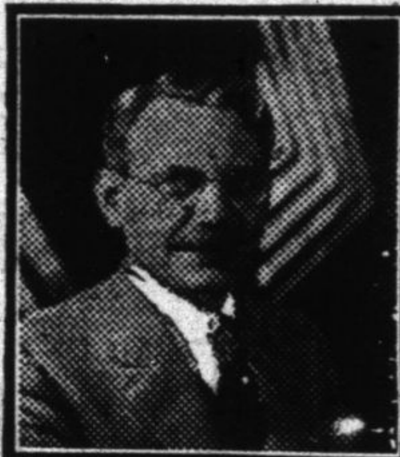
CHARLES OF THE RITZ