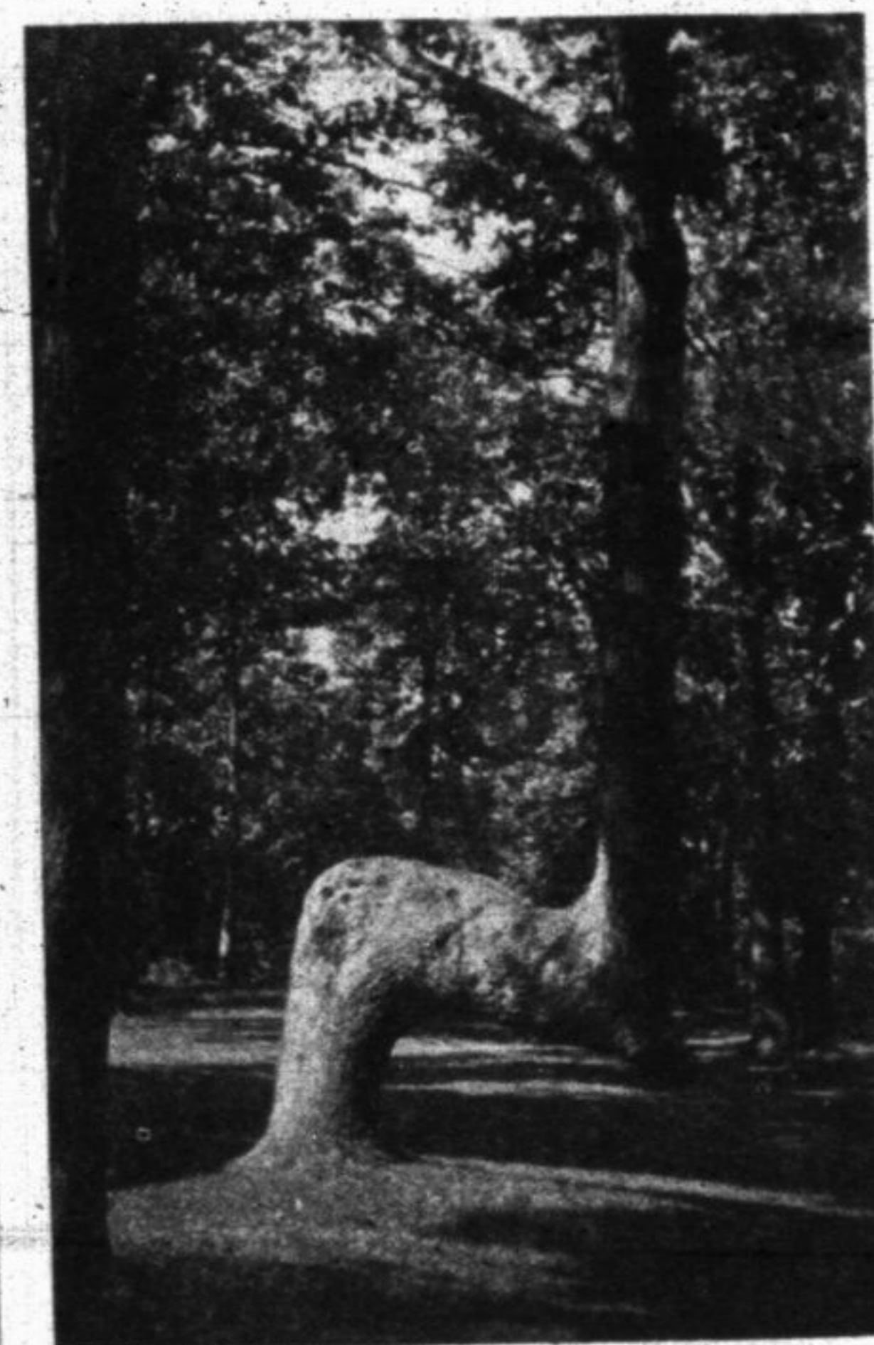
Indian Trail Marker Tree a landmark on Exmoor's course.

The Exmoor course, which the contestants in the Chicago District championship will play, has long been famed as one of the best in the district. Some years ago the course was remodeled and in the intervening