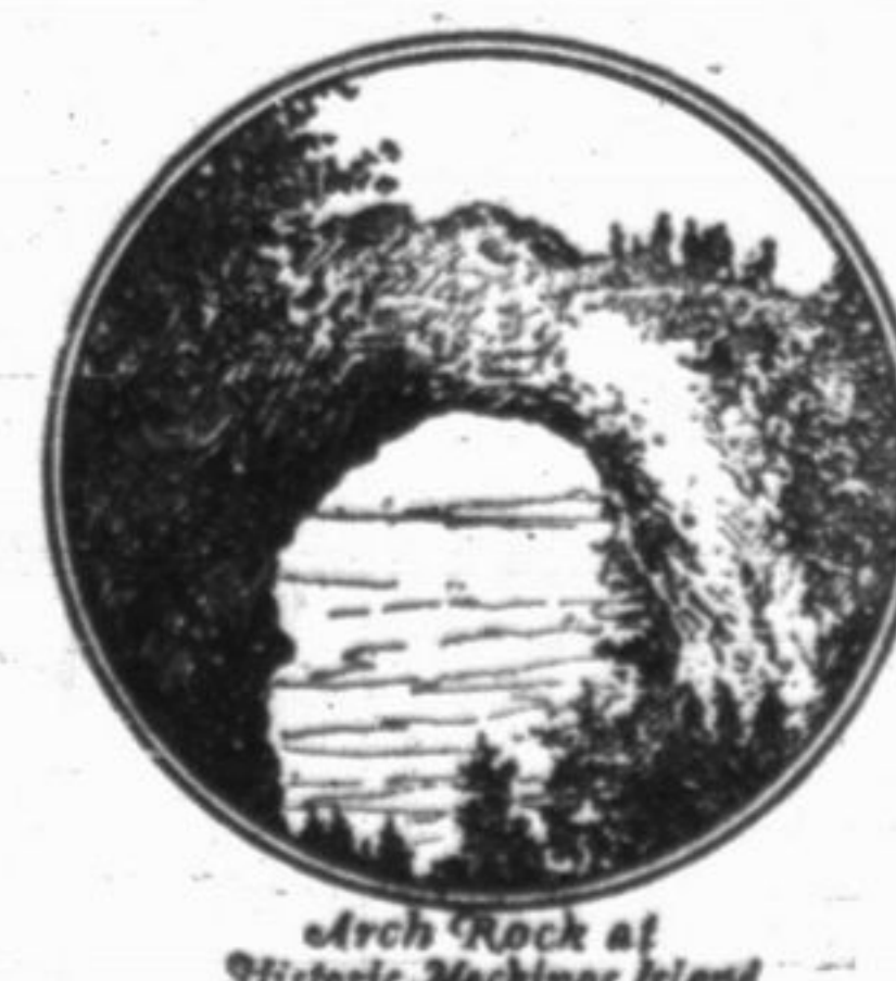
Arch Rock at Historic Mackinac Island

110 West Adams Street Phone Randolph 2960