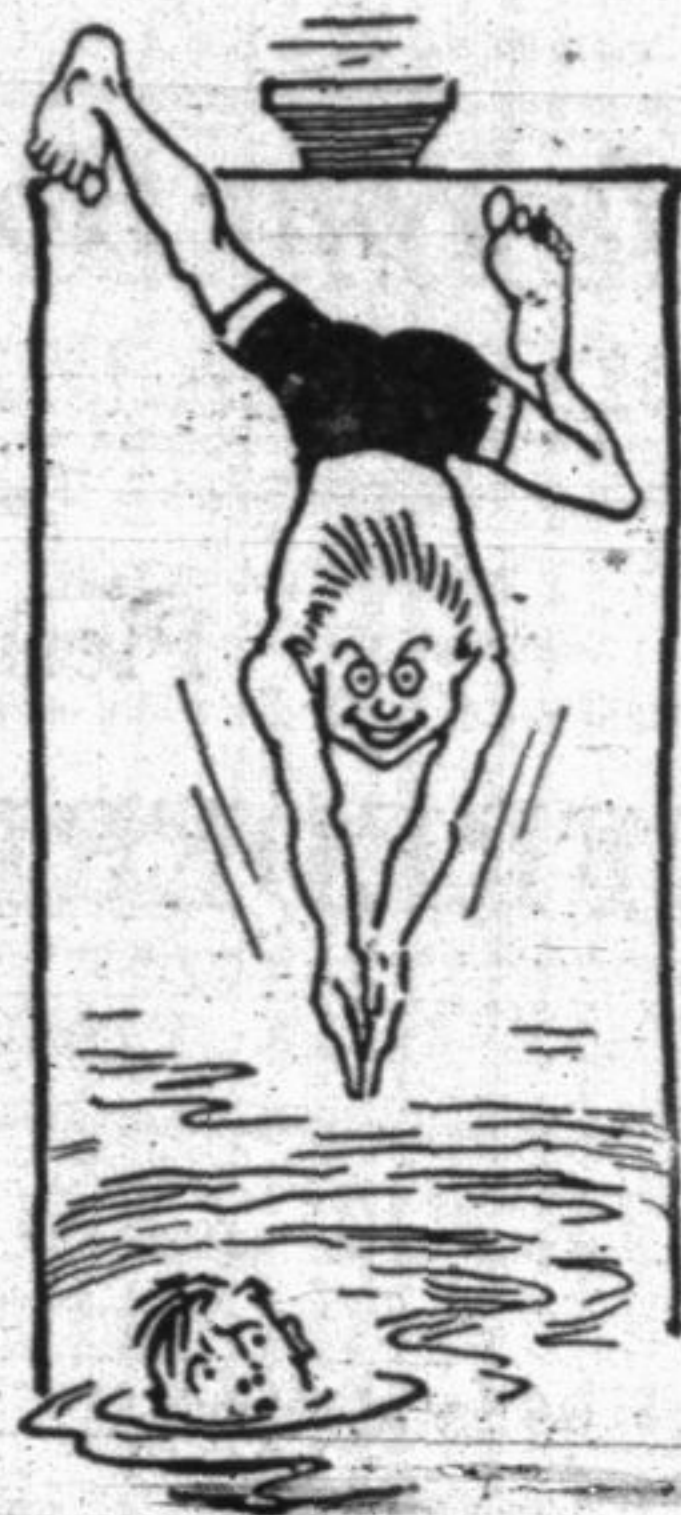
COME ON IN, THE WATER'S FINE AT CAMP —

reached the 100 mark and the period is closed to further applicants. However, there is room in the second and third sessions. These are also filling rather fast so register now. It looks like a shortage of places might result so be prepared, and send your signed application to Boy Scout headquar-