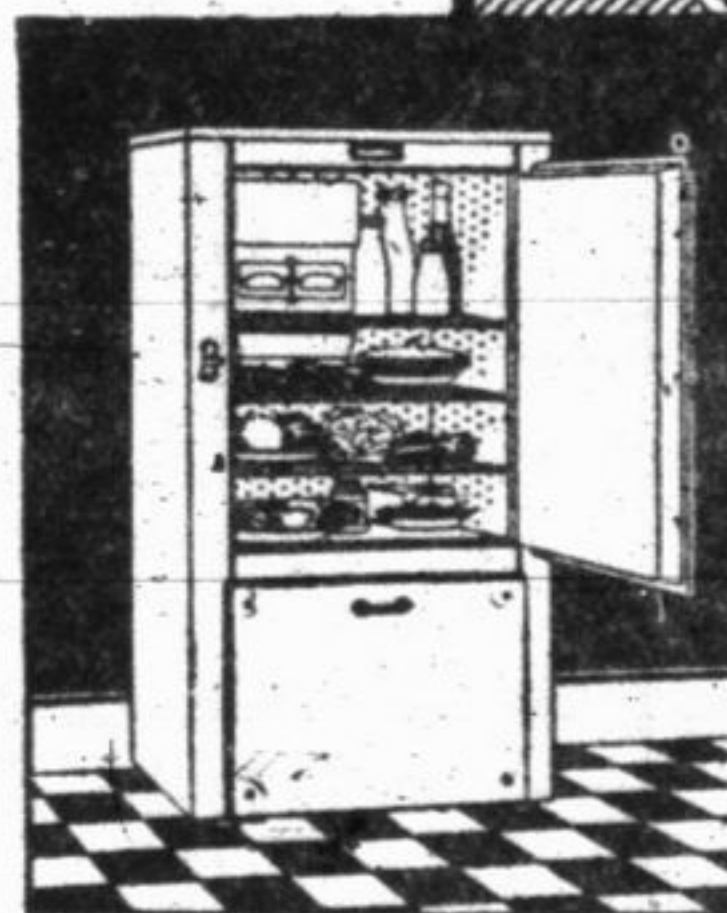
Scores of delicious new recipes are made practical by the new Frigidaire Cold Control.