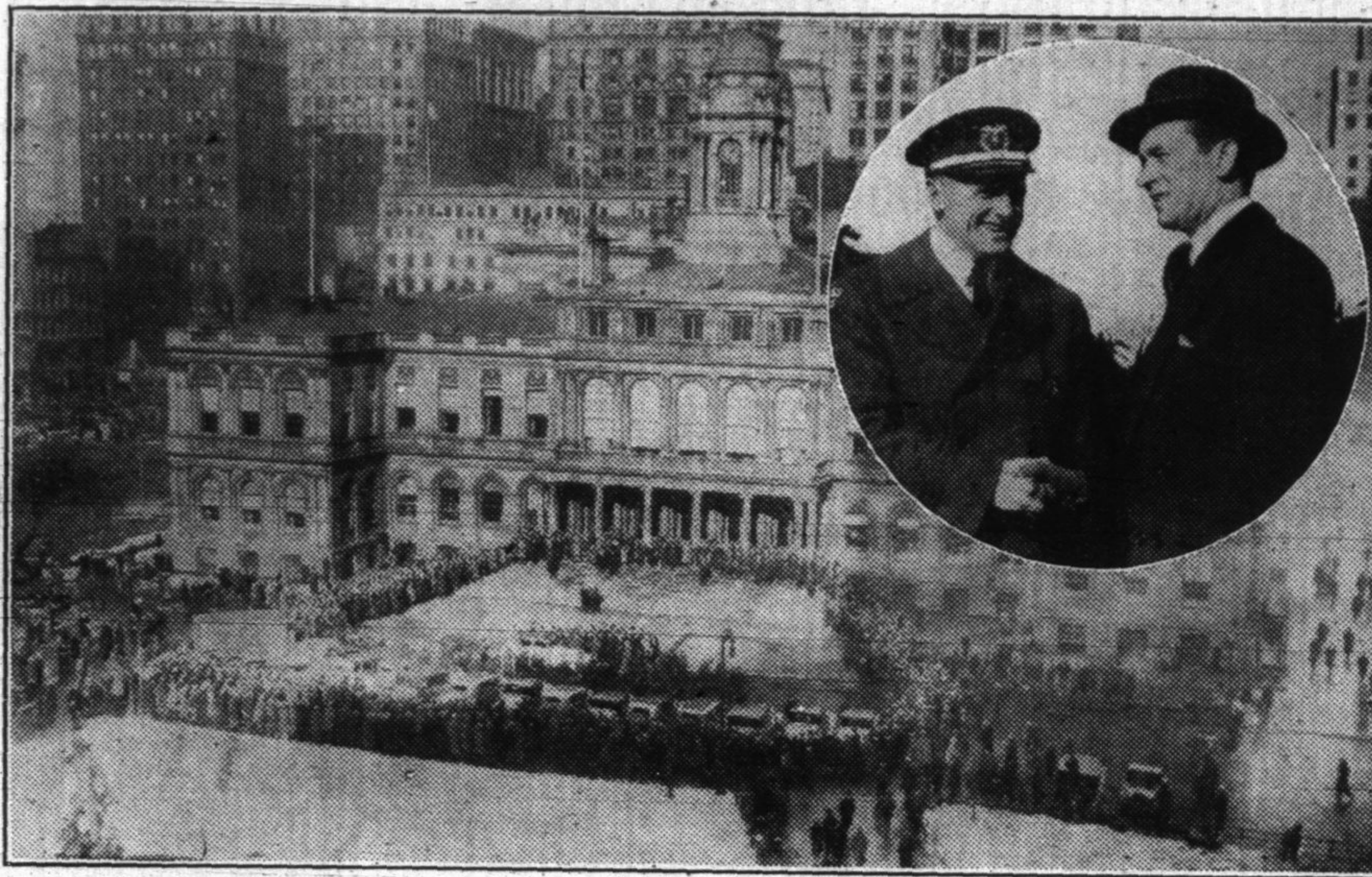
Blaze New York was inspired to cheers, as Mayor Jimmie Walker christened the flagship and sent the fleet on its transcontinental tour with a message of goodwill to the mayor of Los Angeles. Tens of thousands of miles will be traveled by this fleet in a dramatic tour of tire demonstration conducted by Goodrich.