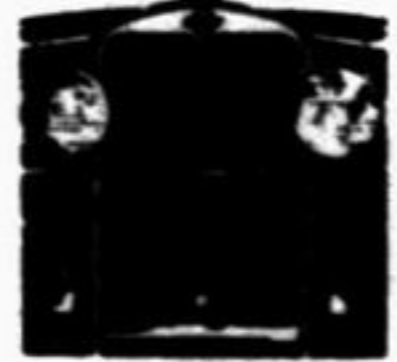
The new chromium plated radiator, lamp standards and rims, are typical fine car features of the Outstanding Chevrolet.