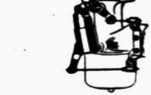
An automatic accelerating pump results in unusually swift acceleration, as well as greater gasoline economy.