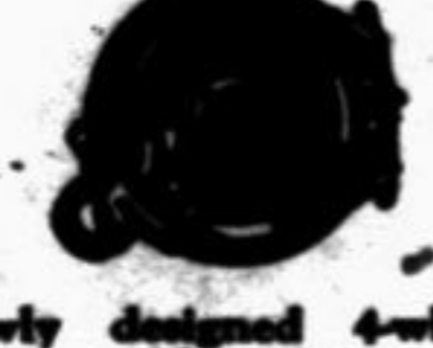
Newly designed 4-wheel brakes with new semi-moulded brake lining, safe—positive—quiet, provide a measure of braking control in excess of the severest requirements.