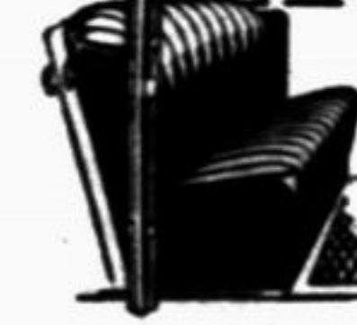
The adjustable driver's seat in all closed models. This brings the clutch and brake pedals within proper reach for all drivers.