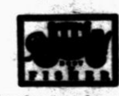
Marvelous new longer and wider bodies by Fisher of hardwood and steel construction, are a distinctive feature of the Outstanding Chevrolet.