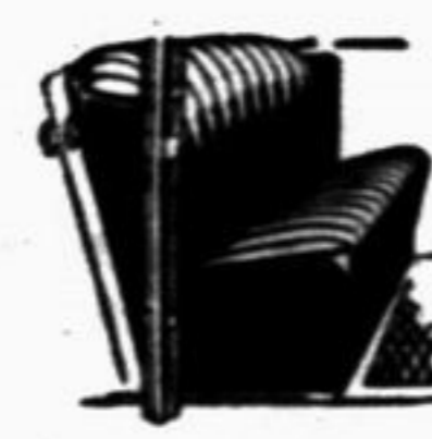
The adjustable driver's seat in all closed models. This brings the clutch and brake pedals within proper reach for all drivers.