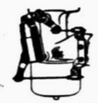
An automatic accelerating pump results in unusually swift acceleration, as well as greater gasoline economy.