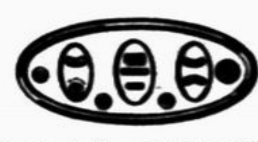
On the indirectly lighted instrument panel are grouped all controls, including the water temperature indicator and theftproof Electrolock.