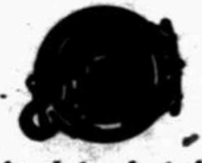
Newly designed 4-wheel brakes with new semi-moulded brake lining, safe—positive—quiet, provide a measure of braking control in excess of the severest requirements.