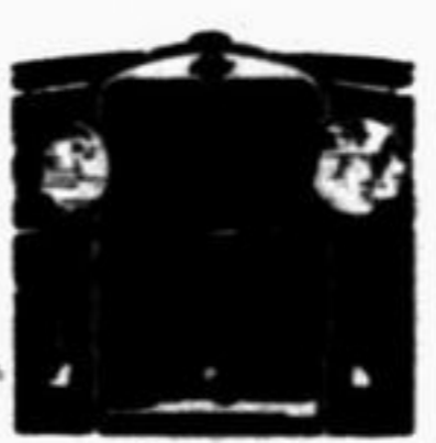
The new chromium plated radiator, lamp standards and rims, are typical fine car features of the Outstanding Chevrolet.