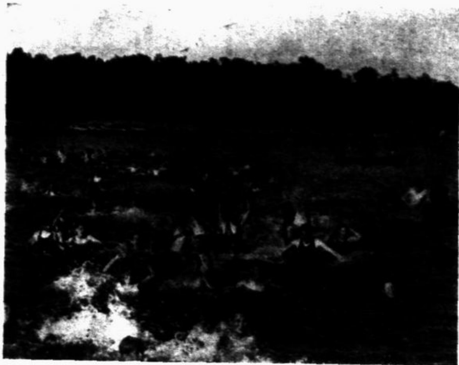
The Water's Edge! It always is in Haka-ja-wan Lake (Indian name for Spring Lake) in the Northern Wisconsin Camp of North Shore boys scouts. Local scouts are looking forward to next summer with many thrills.

Junior Leaders encampment at the Cabin in the Woods, Friday, Nov. 30, 8 a. m., to Sunday, Dec. 2, 8 a. m.