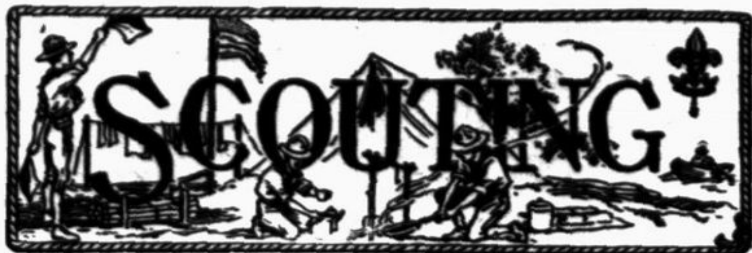
A regular feature prepared each week by members of the Boy Scout Press Club.