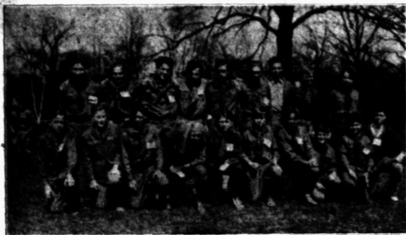
Here They Are—posing for a picture—Northshore Scouts in the Ottawa Tribe at Scout Camp, Michigan.