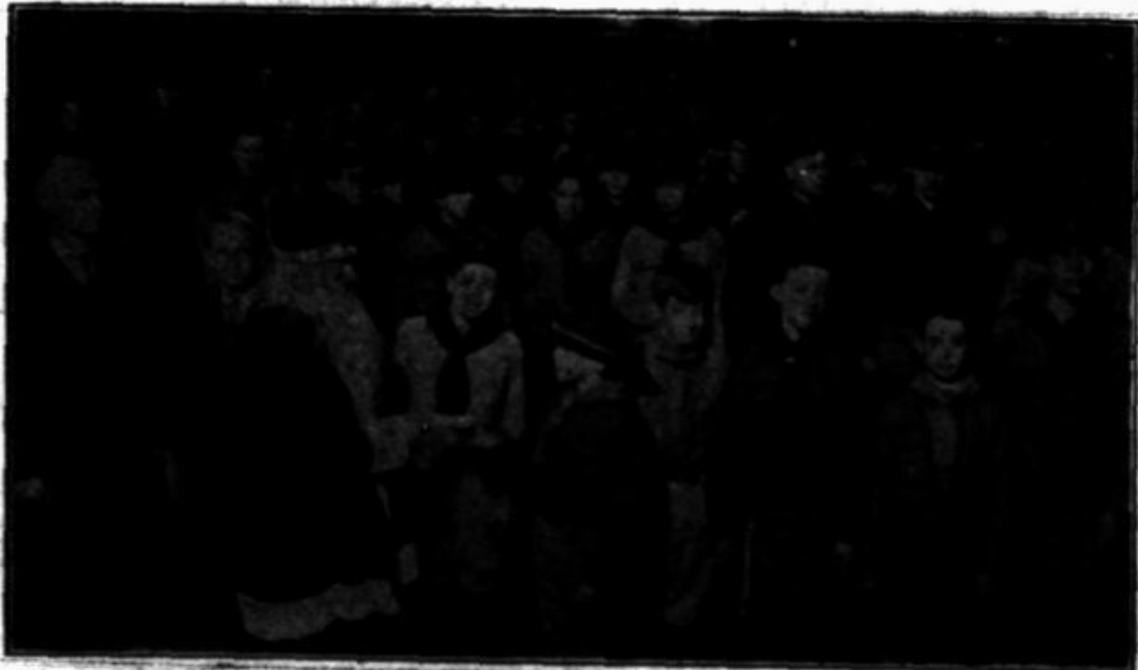
W ILMETTE SCOUTS at monthly rally—Santa Claus attended the rally last December.