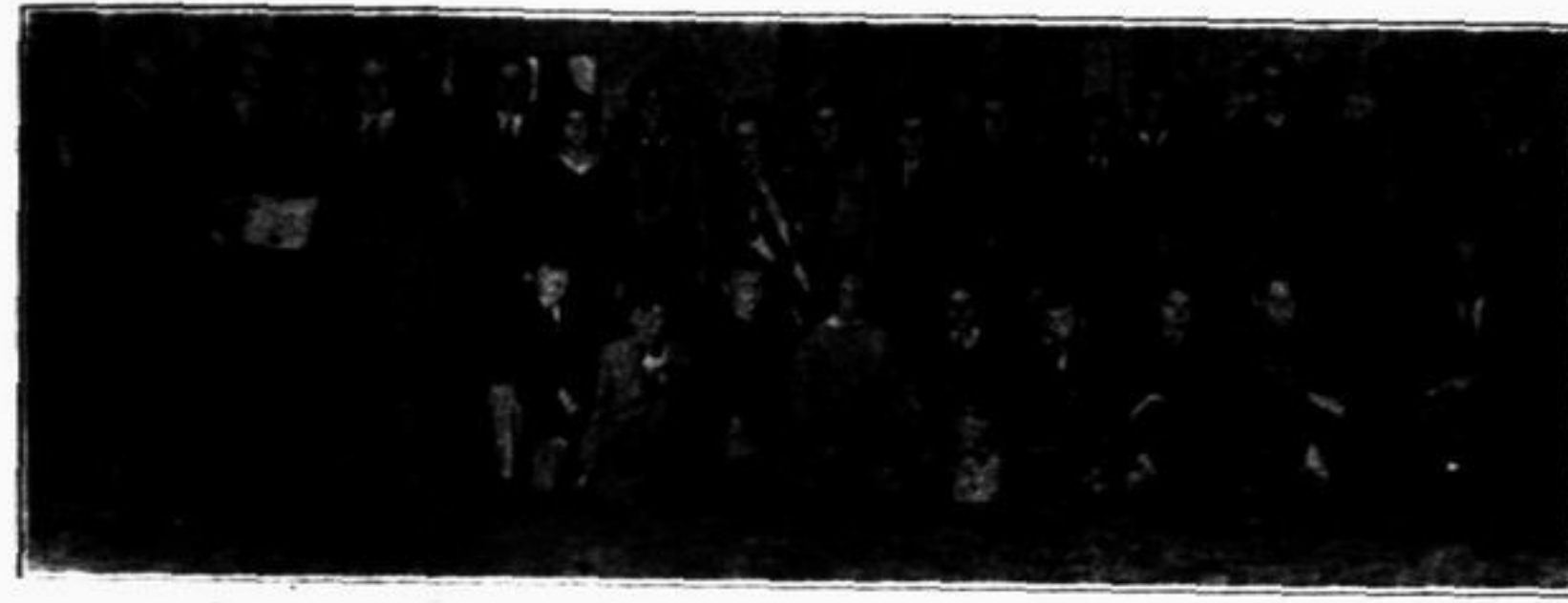
P RESENTS CHAPTER and charges committee of St. John's Church to use the Scout program in the fullest possible way in enriching Boy Life.