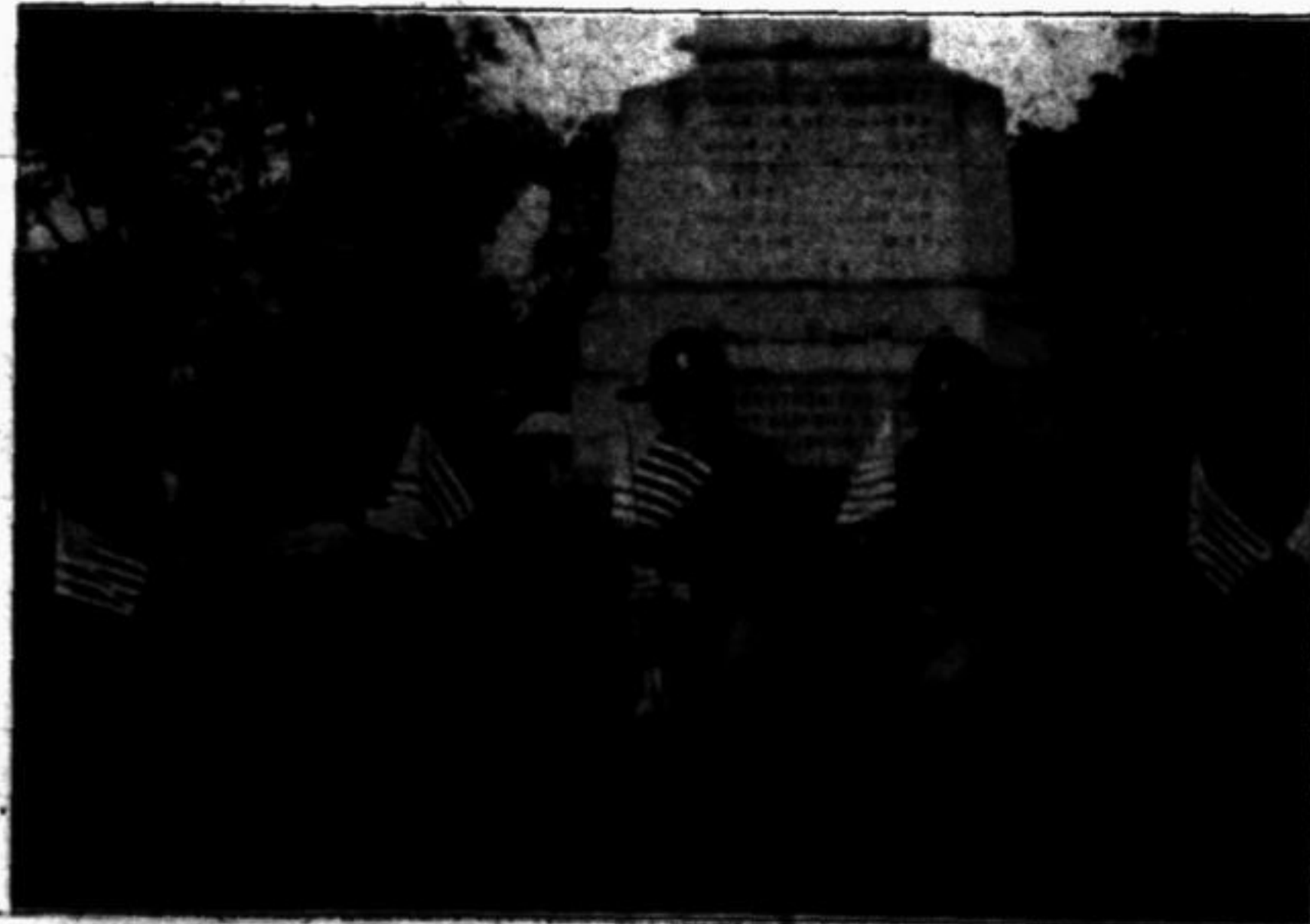
"T O DO MY DUTY to God and My Country"—Scouts decorate soldiers' graves on Memorial Day.