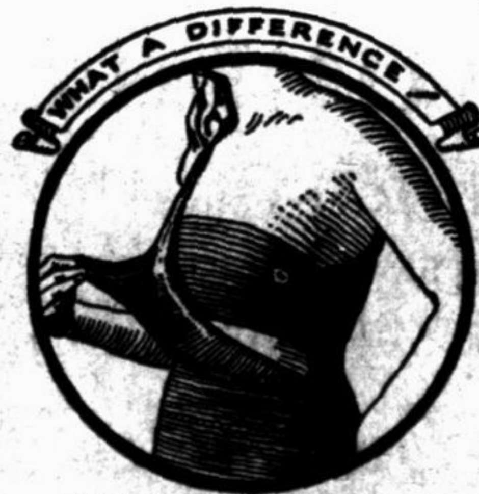
Illustration pictures suit cut open to show "Brassiere-In" Feature

PELTON Swimming Suit with the Brassiere-In