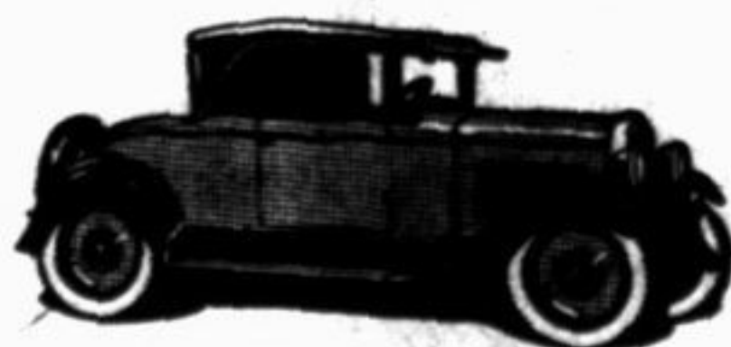
The illustration above shows the Convertible Sport Cabriolet as a beautiful snug Sport Coupe.

But equally impressive is the wide, practical utility of this latest Chevrolet achievement—also a snug closed car for inclement weather . . . an open car for the warm days of summer . . . and ample room for two or four passengers, as the necessity may be! Visit our showroom today and see this sensational new car!