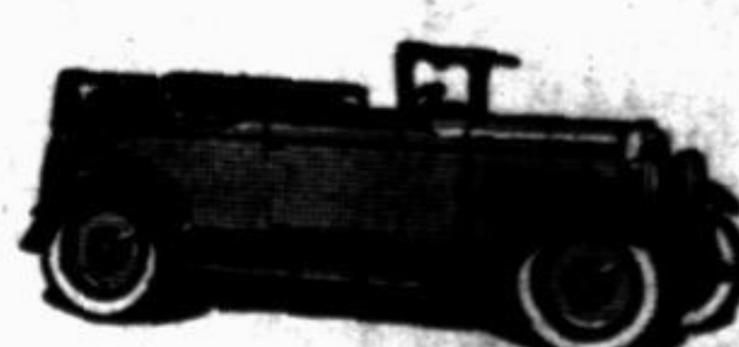
The Convertible Sport Cabriolet may easily be turned into a distinctive open sport car, as illustrated above.