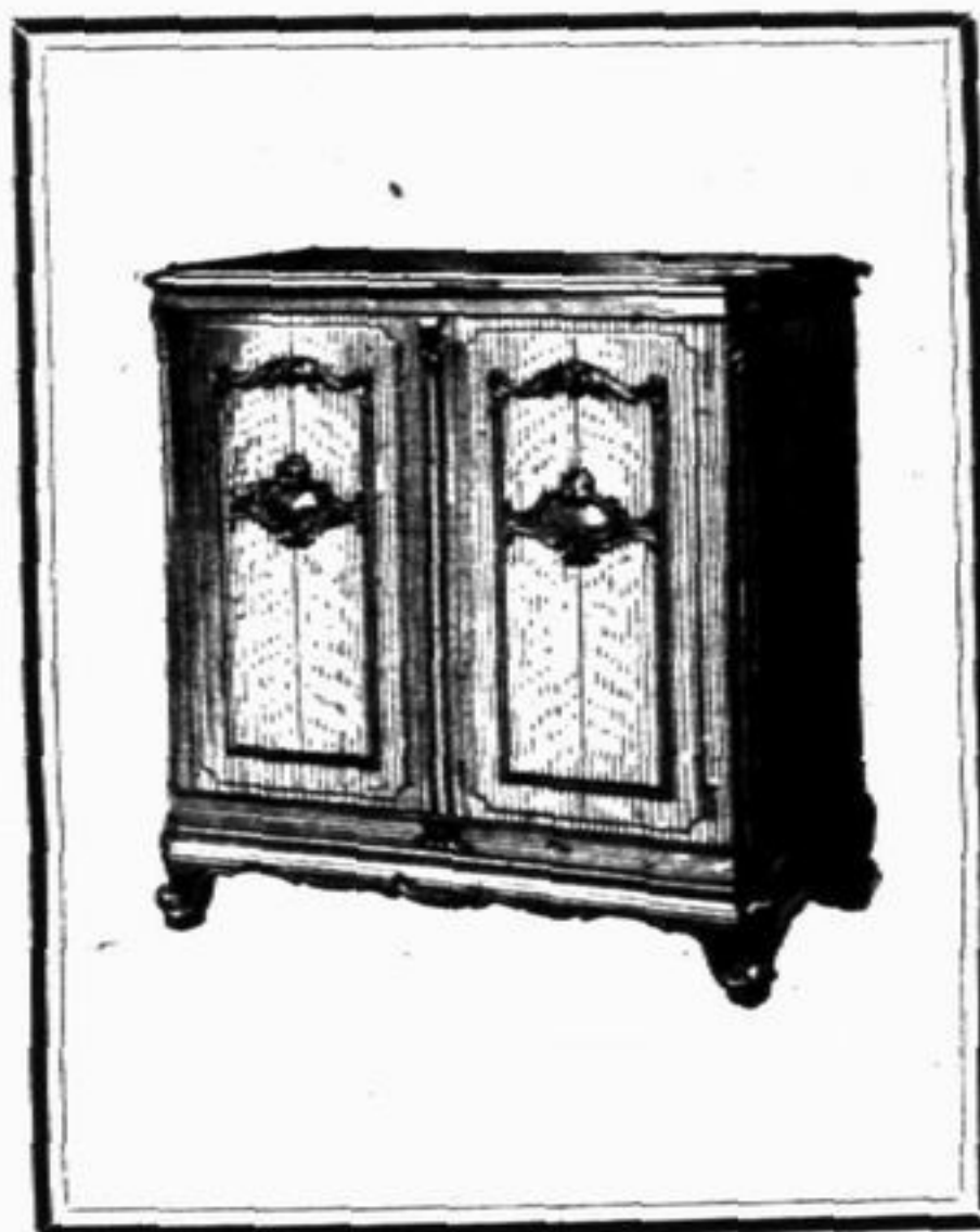
Automatic Orthophonic Victrola