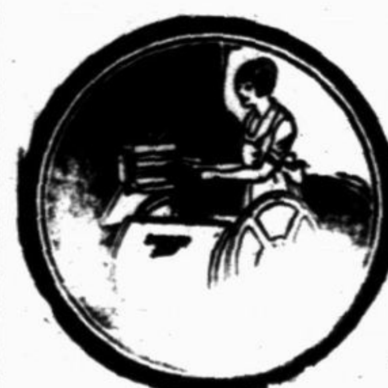
CLOTHES WASHER Sanitary—Quick—Economical

A $5 down payment will place one of these labor saving devices in your home.