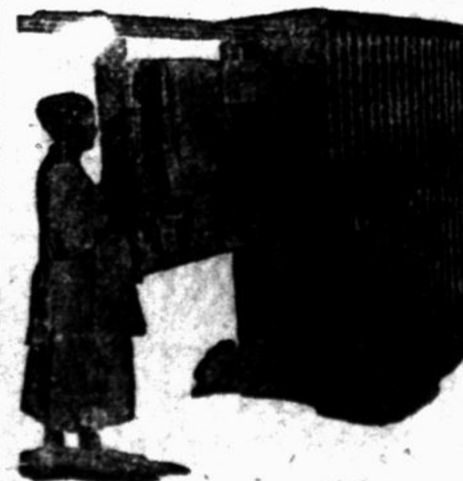
CLOTHES DRYER Gas Fired—It Dries Bleaches—Sterilizes