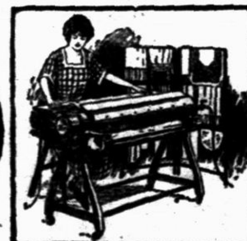
CLOTHES IRONER A Time and Labor Saver