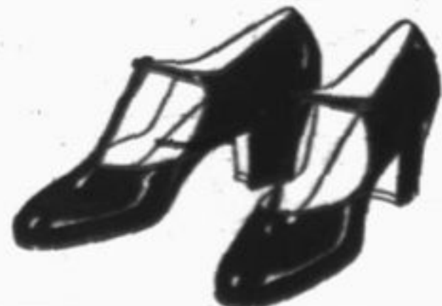
The T-Strap Nine Dollars

Evanston Shop Open Tuesday, Thursday and Saturday Evenings