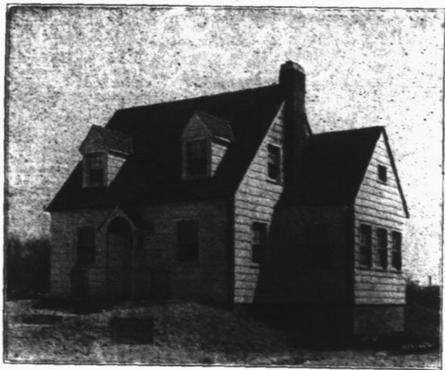
One of the Wilcox Special Built Homes

24 N. First Street Highland Park Illinois RAPP BROS. Telephones Highland Park 1677-1678 1679-1680