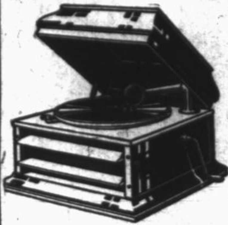
Portable Phonographs $10 up

Do not deprive yourself of music while on your trip, take one of our portable phonographs or radios with you. We have the smallest phonograph in the world, the "Mikiphone" which will fit in your pocket. We also carry a complete line of portable radios.