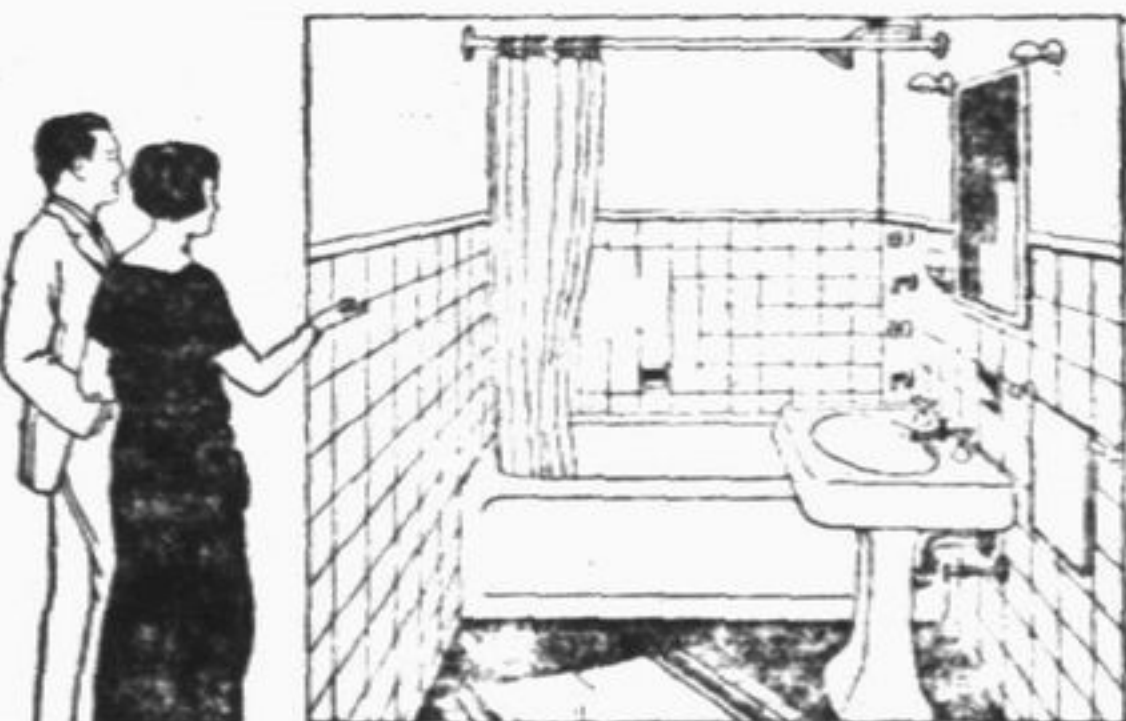
KOHLER OF KOHLER

—16 Ribbed Silk Parasols in black, red, green and blue. Amber handle and tips. Newest styles. Unusual values at $5.00