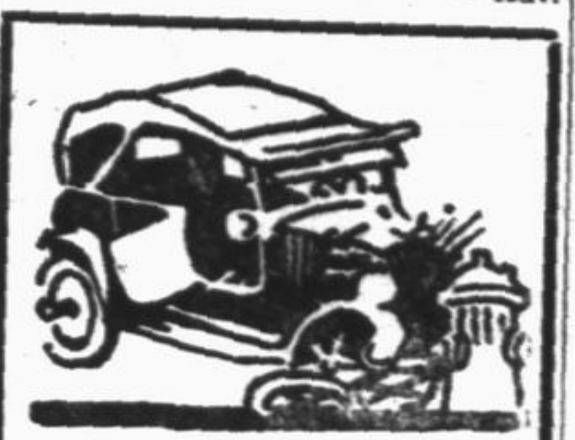
This sketch was made from an actual photograph

HOWARD-UDELL CAFETERIA will serve one meal only Decoration Day, Monday, May 30th. An unusually good dinner menu will be served from 12:00 to 2:30. Always a good dinner Sunday, too, same hours as above. —Adv.