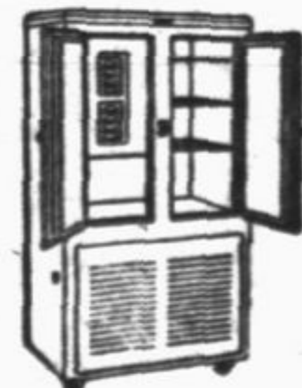
Servel Model S-7 $395,

Today electric refrigeration has become an accepted convenience in modern homes the country over.