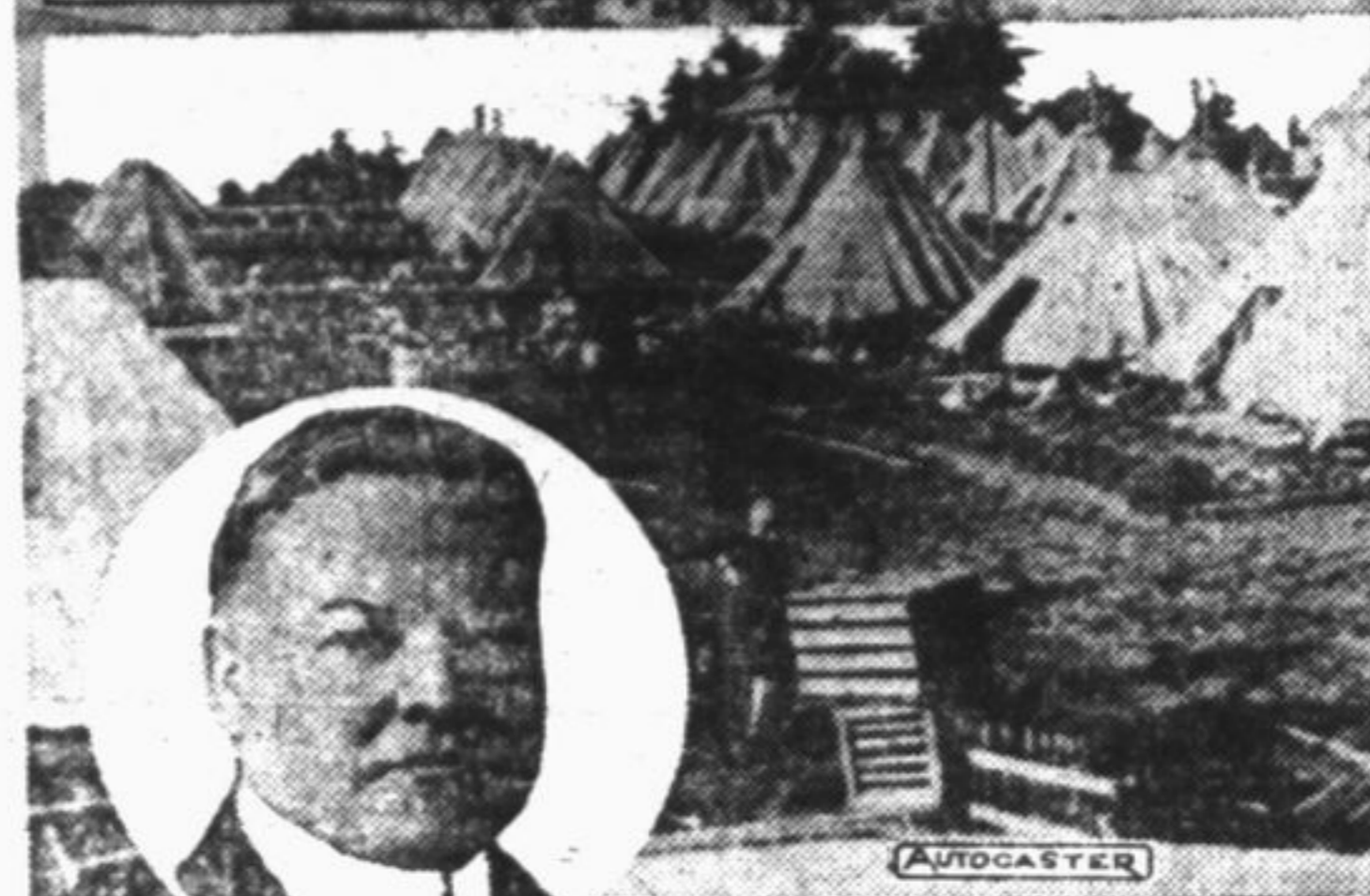
Herbert Hoover More than 300 dead and 200,000 homeless are in the Mississippi, Missouri and Ohio valleys as waters recede on the most destructive river-flood the nation has ever known. Secretary of Interior Herbert Hoover has been assigned by the President to personally direct all relief work as the nation contributes funds. Upper photo is an airplane view of Greenville, Miss., under 20 foot of water. Lower photo a typical tent city which now dot the highlands, St. Louis to New Orleans.