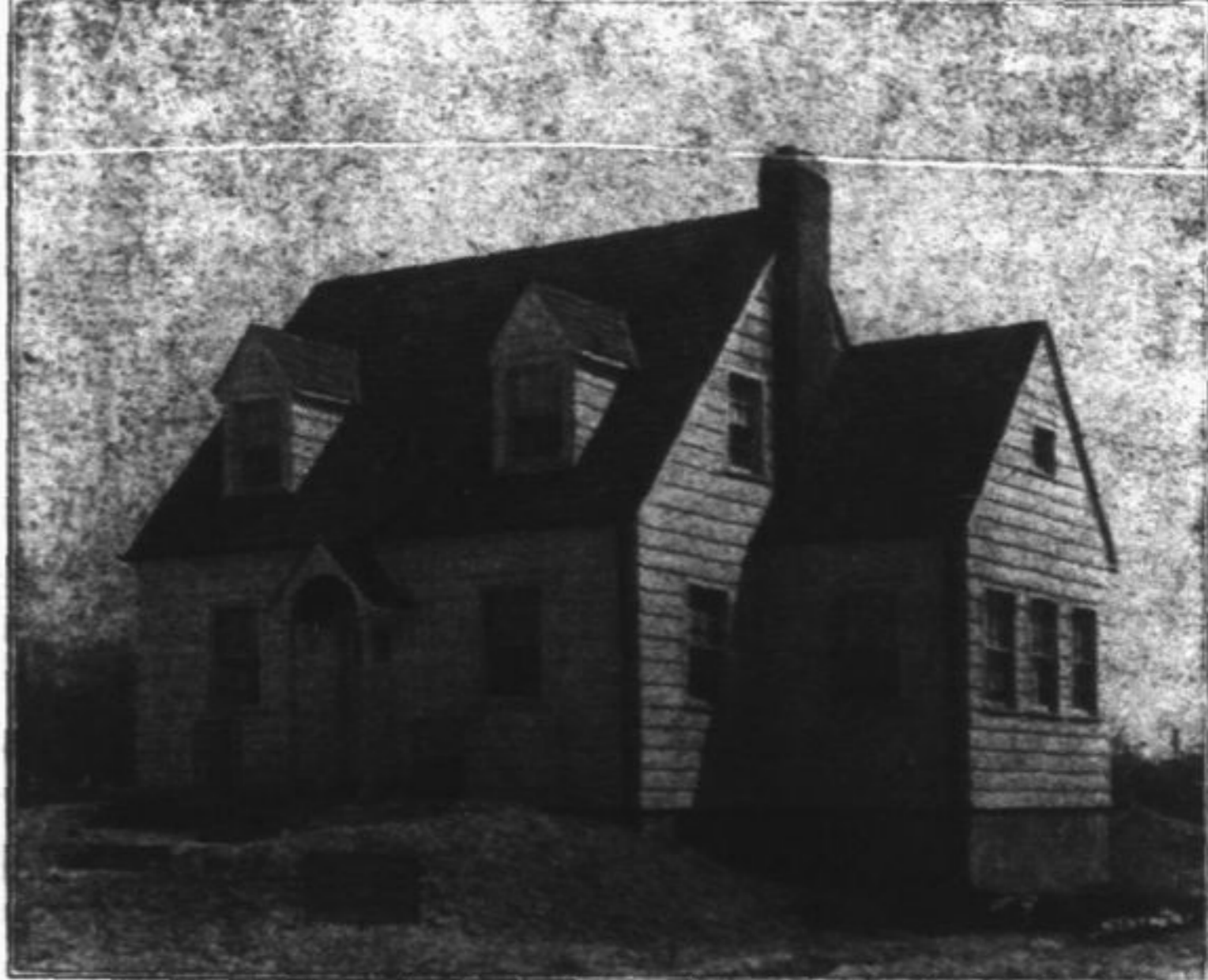
One of the Wilcox Special Built Homes