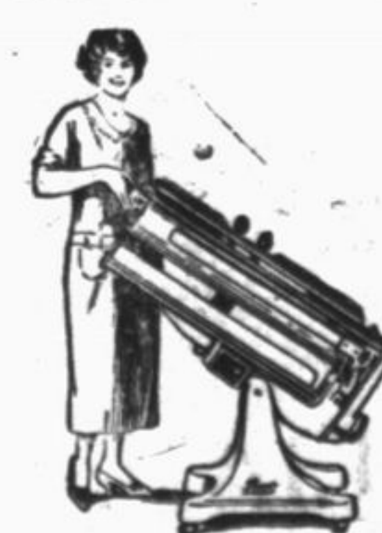
Folds into Small Space Complete open end Roll