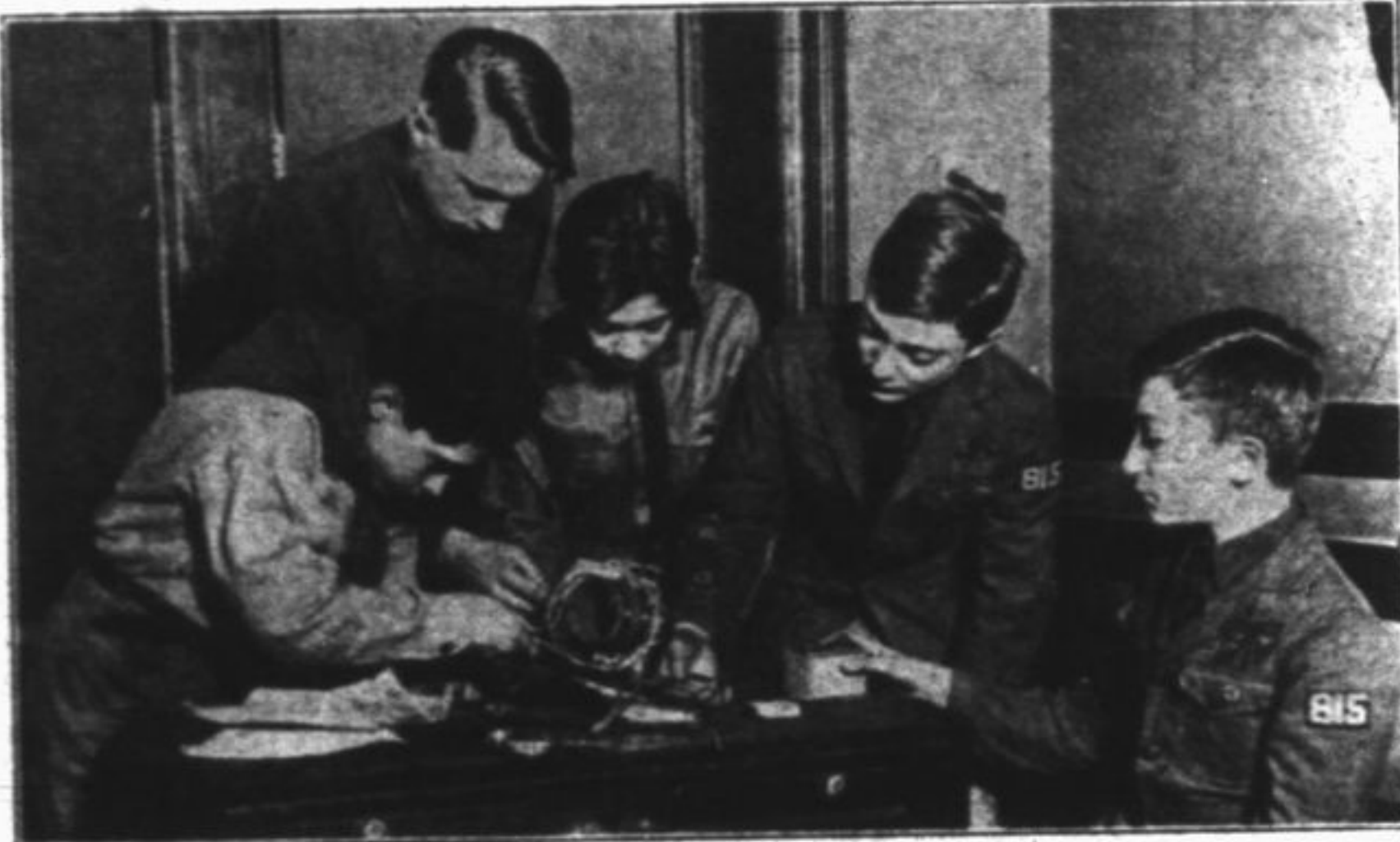
BOY SCOUTS AT WORK ON MERIT BADGES FOR MAY 6 AWARD

Awards will be made to approximately 100 scouts who have earned an advancement in rank during the last month.