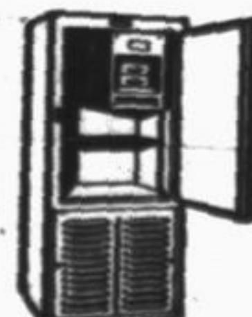
Refrigerator $250 Installed

WHOLESONE foods—firm crisp salads—appetizing frozen ices and desserts—viands savory and fresh—these are joys of Electric Refrigeration! Always cool, always dry, it maintains a constant low temperature which preserves food for a surprisingly long time . . . Come in and select from several desirable models.