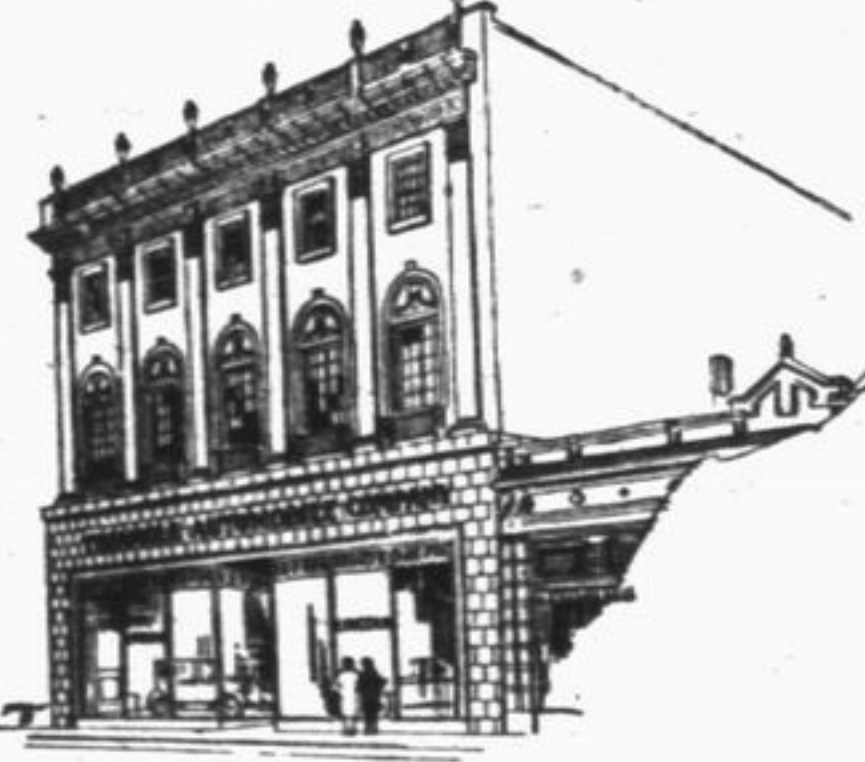
Woodlawn Branch 6052 Cottage Grove Ave. Tel. Plaza 1710