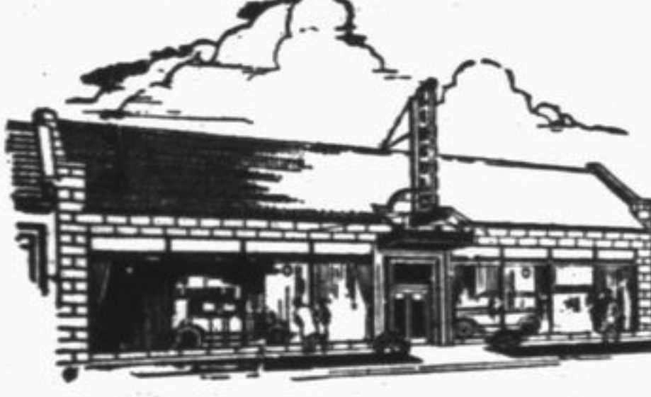
Evening Branch 1824 Ridge Ave. Tel. Rogers Park 4485