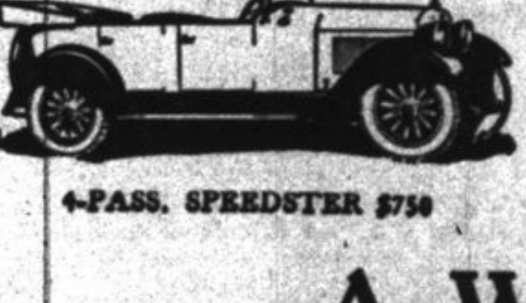
4-PASS. SPEEDSTER $750

In performance as well as appearance, the Essex Super-Six is an entirely new car.